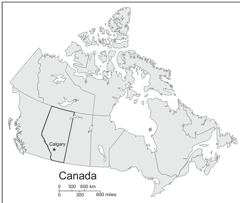
Fig. 2. Calgary, Alberta, Canada.

of several studies. For example, Botzen et al. , (9) in a study of Dutch residents living across a wide geographic area (vs. concentrated in a single urban center), showed that prior experience with flooding was positively related to judgments about flood risk; these results make sense, but leave open questions about what constitutes experience in this case: Was it the indirect experience of observing a flood within a community, or was it direct experience associated with evacuation ? Our study sought to disentangle the question of experience according to evacuation status during the 2013 Calgary flood. Thus, we hypothesized that people living in an at-risk community during the Calgary flood, and who were evacuated in 2013 , would perceive greater risk in comparison with people who did not live in an at-risk community, and with people who did but who were not evacuated.