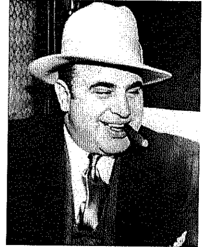
Al Capone smiles as he smokes a cigar on his way to Atlanta Federal Penitentiary after conviction for Federal Income Tax Evasion on May 4, 1932, in Chicago.

Syphilis has three major stages. The primary stage is heralded by a painless sore, or chancre. Because the infection is typically transmitted sexually, that sore is most commonly found on the genitals and appears anywhere from three to 90 days after exposure. After the chancre heals, the infected person then experiences a rash over all or much of the body. This secondary stage occurs four to 10 weeks after exposure. And then the infection goes quiet — without any symptoms or problems for years. But syphilis is merely fooling the infected individual that all is well. Over the next several years, the syphilis microbes are pathologically boring their way into various organs of the body, especially the liver, the heart and the brain. When the symptoms of this damage do appear (the third stage of syphilis), a decade or more after infection, it is typically too late to change the disease’s march toward killing the infected person.