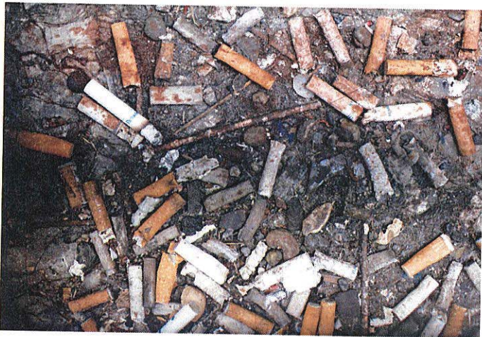
Discarded cigarette butts are seen beneath a sidewalk grating in New York City, May 8, 2017.

Take a tip from this aging doctor, if not from Surgeon General Terry: If you do smoke, get some help to kick the habit. If you have not yet picked up your first cigarette — DON'T! You will likely live longer as a result of this sound decision.