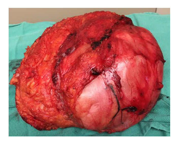
FIGURE 2 Intraoperative image of the breast mass [Color figure can be viewed at wileyonlinelibrary.com]

The patient subsequently underwent simple mastectomy which showed an approximately 28 cm, predominantly encapsulated mass consisting of lobulated adipose tissue admixed with bands of fibrous