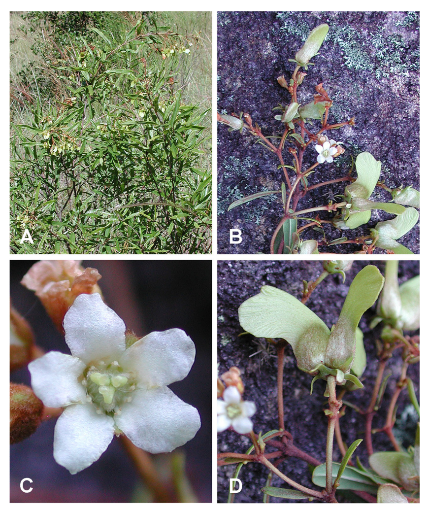
FIG. 2. Sphedamnocarpus andersonii. A. Habit. B. Distal portion of inflorescence. C. Pistillate flower with reduced androecium. D. Fruit.

each pedicel subtended by a bract 1.1-1.7 mm long and a pair of bracteoles 0.5-0.7 (-1) mm long, bracts and bracteoles narrowly triangular. Sepals 5, 2-2.5 \times 1.3-1.5 mm, elliptical to oblong, glabrous adaxially, sericeous-tomentulose abaxially, eglandular. Petals 5, white to cream, claw 0.6-0.8 mm long, limb 3.5-4.2 \times 2-3 mm, elliptical-oblong, margin subentire. Stamens 10, glabrous, the filaments connate at base, anthers with a large dark red connective. Ovary tricarpellate, densely hirsute, styles three, each with a large terminal stigma. Staminate flowers: filaments opposite sepals 1.7-1.8 mm long, those opposite petals 1.3-1.5