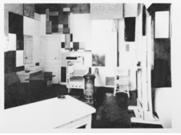
Piet Mondrian's Studio

The most exciting aspect about what Mondrian talks about is that the décor within one's home can showcase the manifestation of one's thoughts. Mondrian's studio can be seen to quite clearly relate to his works like his famous Tableau 2, with Yellow, Black, Blue, Red and Grey that employs a grid system and color blocking. This manifestation of his work through