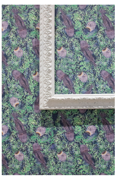
Series of images of Terraphilia installation at Penny W. Stamps School of Art & Design.