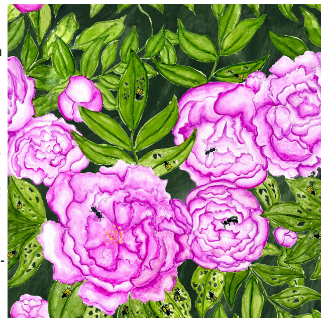
Detail of peony pattern, showing damage of peony leaves by the Japanese Beatle, and the Spring Tiphia wasp that is parasitic to the Japanese Beatle larvae.