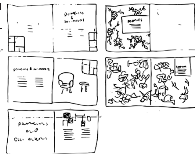
Thumbnail sketches for book.

The product of Terraphilia is a mock interior decorative exhibition including wallpaper, a re-upholstered chair and a pattern sample book that features the patterns I have created. This decision came about as I pondered how I wanted people to interact with the work. Terraphilia is meant to be grotesquely beautiful, a reminder that though some of these species are beautiful, they can prove to be detrimental to our ecosystems. These patterns are meant to be a shocking reminder of this and are meant to engulf their viewers. The patterns repeat and expand just as invasive species breed and spread, especially when they do not have any natural predators. The idea that they could be decorated on everyday objects and that they could act as talking pieces for people that are unaware