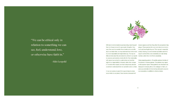
Introductory pages of final book.