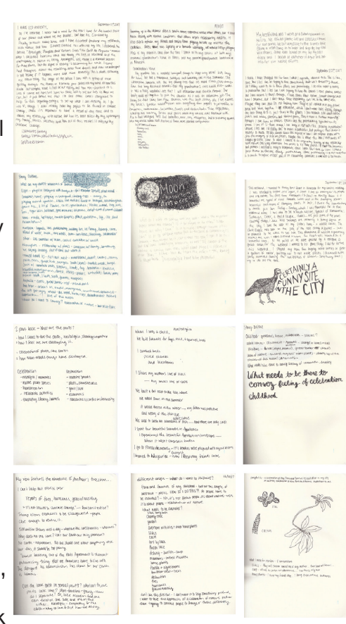
Personal journal entries with illustrations.

From the start, I wanted Terraphilia to be a manifestation of my own relationship with nature, to understand how I have become disconnected with our natural world. I wanted to depict my struggle with wanting humans to have more accountability for our Earth, but how I find it extremely difficult. This struggle resulted in various personal narratives and diary-like entries surrounding themes of my own relationship with nature and how I currently felt about the environment. This then turned into writing about how I have interacted with nature throughout my quite short life, especially noting certain recurring events that I find prominent. Their prominence, along with most of my writings, constantly reverted back to climate change. Part of my struggle with depicting my