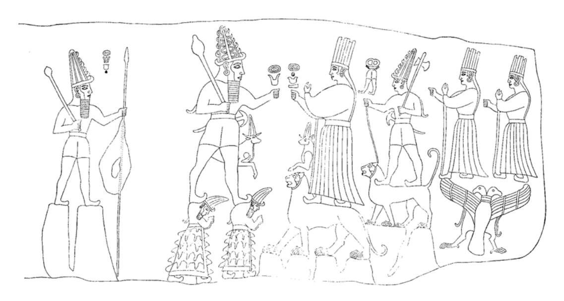
Figure 8.1. Central panel in Chamber A at Yazılıkaya. After Akurgal 1961, p. 79, Abb. 19

This expedient is reflected in the general principle of royal succession set forth in the Proclamation of King Telipinu: