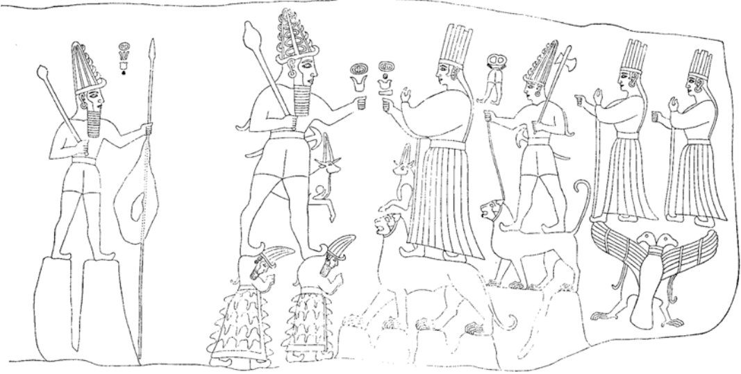
Figure 8.1. Central panel in Chamber A at Yazılıkaya. After Akurgal 1961, p. 79, Abb. 19

This expedient is reflected in the general principle of royal succession set forth in the Proclamation of King Telipinu: 10