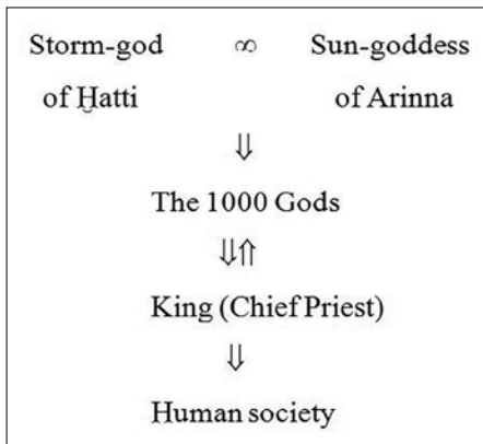
Figure 8.2. The Hittite social universe

The title “Great King of Ḫatti” was synonymous with “Chief Priest of the Sun-goddess of Arinna,” 13 which indicates that on the ideological plane the human monarch functioned as steward or regent of this deity. 14 Since she also bears the epithet “Arinniti,” “She of Arinna” — an adjective of appurtenance borrowed from the Hattic language of central Anatolia — and plays a prominent role in the few religious texts preserved from the pre-Hittite culture that employed this tongue, 15 it is reasonable to conclude that her pairing with the Storm-god of Indo-European origin 16 was the result of an accommodation of indigenous beliefs with the cosmological conceptions of the latecomers to the region.