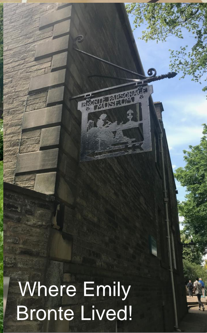
Where Emily Bronte Lived!