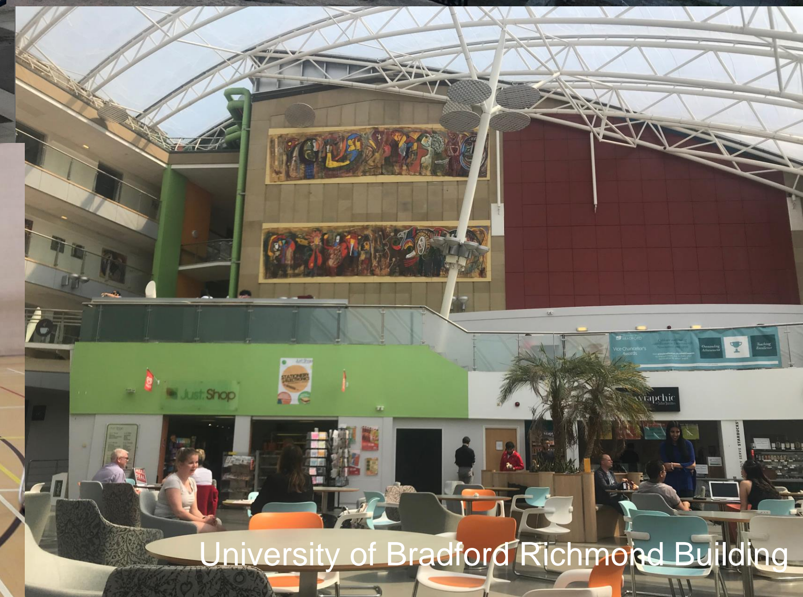
University of Bradford Richmond Building