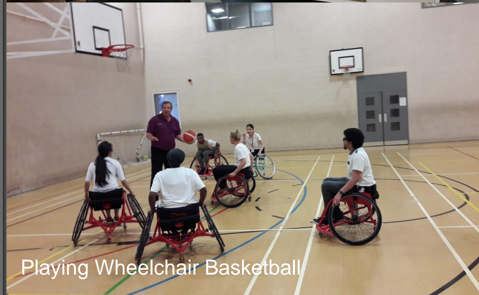
Playing Wheelchair Basketball