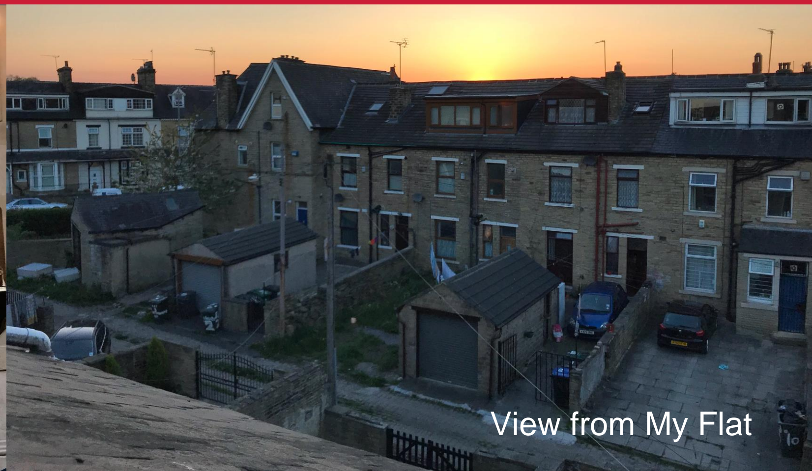
View from My Flat