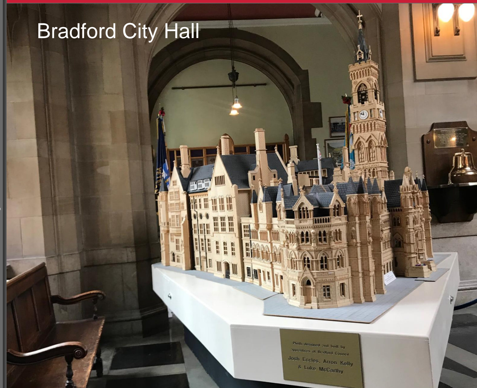
Bradford City Hall