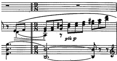
fig. 1.3 "Im Treibhaus"