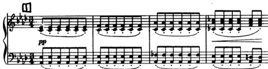
fig. 2.1 Beginning of "Träume"

As for the relation between "Träume" and the love duet from Tristan und Isolde , the connections are a common key of A-flat major, similar rhythm, and triple time. These two styles express the rapture and ecstasy of unattainable love.