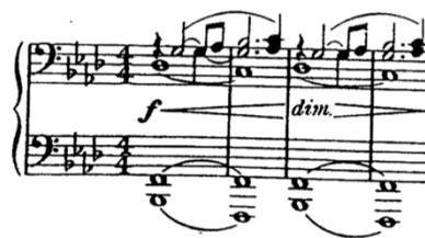
fig. 1.2 Prelude of Act III ( Tristan und Isolde )