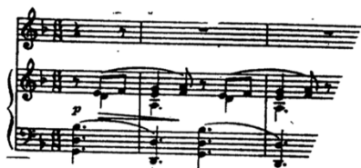
fig. 1.1 "Im Treibhaus"