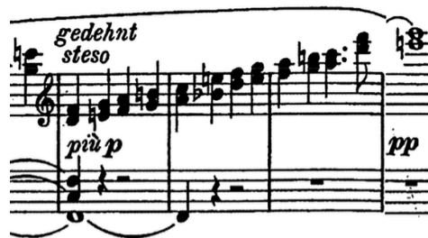
fig. 1.4 Prelude of Act III ( Tristan und Isolde )

On the other hand, the keys of the two pieces are different. "Im Treibhaus" is in D minor and the prelude of Act III in F minor. "Im Treibhaus" modulates through various keys in a recitativo style with liberal use of tremolo and staccato. In the prelude of Act III, the only prominent musical material shared with the song is a similar chromatic sequence.