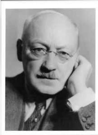
Figure 3.5: Hugo Alfvén

Swedish composer Hugo Alfvén began his musical career as a violinist in the opera orchestra of Stockholm. 116 He would go on to become one of the great Swedish composers and choral conductors of the late Romantic period. As a conductor, he conducted the Siljan Choir in the region of Dalarna for more than fifty years. 117 As a composer, he drew heavily on folk songs and themes throughout his music. 118 Outside of song, his compositions included five symphonies, ballets, many chamber music pieces, and rhapsodies. 119 His songs were popularized by the great Swedish tenor, Jussi Björling, who regularly included them on his international recitals. 120