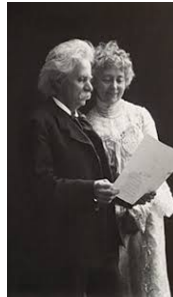
Figure 1.2: Edvard and Nina Grieg

Edvard and Nina returned to Norway in 1866, settling in the capital Christiania (today's Oslo). Grieg took the position of conductor at the Philharmonic Society, and established himself as a teacher. His concert debut came on October 15 th with a program