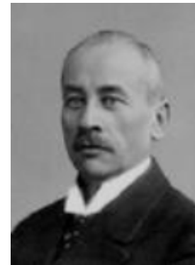
Figure 3.6: Oskar Merikanto

“Elämälle” is one of Merikanto’s most popular songs. The text, written by ophthalmologist and poet Ernst V. Knape, was translated into Finnish from its original Swedish poem, “Hell dig, liv!” Its grandiose accompaniment and theatrical text give this song nationalistic and inspirational qualities, which ultimately makes it incredibly attractive for both the singer and the audience.