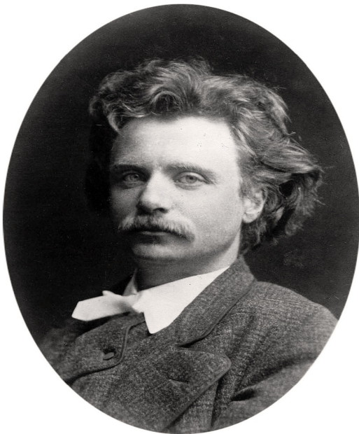
Figure 1.1: Edvard Grieg

I come from a family who takes great pride in our Norwegian heritage. Whether it's the lefse and krumkaker at Christmastime, the excessive coffee we all drink, or using our Norwegian sweaters to keep warm during the snowy Minnesota winters, we love to embrace our ancestry and its traditions. However, we stay away from the lutefisk , and you should too! Early on in my musical development my "Norwegianess" inspired me to delve further into romanser , which are Scandinavian art songs. This led to my discovery of the music of Edvard Grieg, who was responsible for developing a truly Norwegian style of music through his use of folk-like melodies and specifically Norwegian poets. However, his music is too infrequently performed in the original