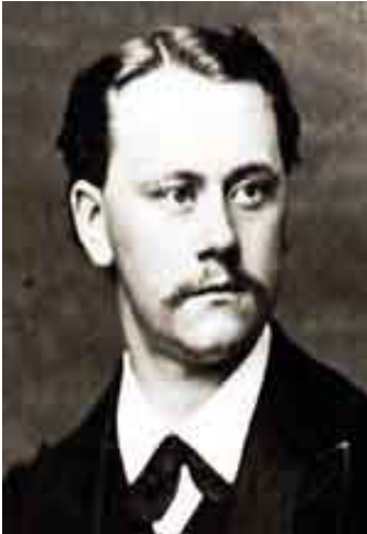
Figure 3.3: Henri Duparc

Henri Duparc was a perfectionist composer whose compositional output only includes sixteen mélodies and one duet. This limited output of mélodies was fully composed within a period of seventeen years. Duparc's self-criticism lead him to destroy many songs, refusing to let them be published or heard by the public. 98 Despite his limited output, his songs are considered treasures within the entire French mélodies repertoire.