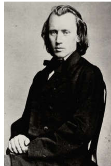
Figure 3.2: Johannes Brahms