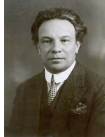
Figure 3.4: Ottorino Respighi

“Invito all danza” is a flirtatious song whose narrator exploits nautical imagery in an attempt to invite his beloved to a dance. The rising and descending vocal lines dramatically mimic the movements of the sea. Although this song is far less impressionistic than Respighi’s other works, it demonstrates his ability to create great compositional settings and narratives within his music.