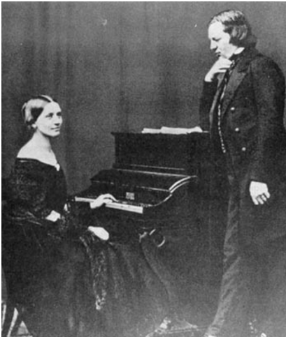
Figure 3.1: Robert Schumann & Clara Wieck-Schumann

The marriage of Robert Schumann and Clara Wieck is one of the more significant in the history of Lieder , and perhaps all of music. Clara was one of the preeminent pianists of her time, as well as a composer and teacher. Robert was one of the foremost