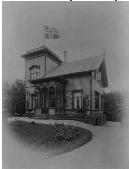
Figure 1.3: Troldhaugen in Bergen, Norway

In 1874, Grieg received a composer's grant from the Norwegian government that allowed the Griegs to relocate to the capital city of Bergen. Henrik Ibsen wrote to Grieg asking if he would write the incidental music for his play Peer Gynt . This music, which took Edvard two years to compose, would become one of his most famous works. Grieg faced many personal difficulties between 1875-76 with the death of both his parents and his marriage to Nina becoming strained. 10 These struggles inspired another collaboration between the composer and Ibsen's poetry. Almost all of the poems in Opus 25 express the pain of loss, which includes perhaps most movingly in his masterpiece "En Svane."