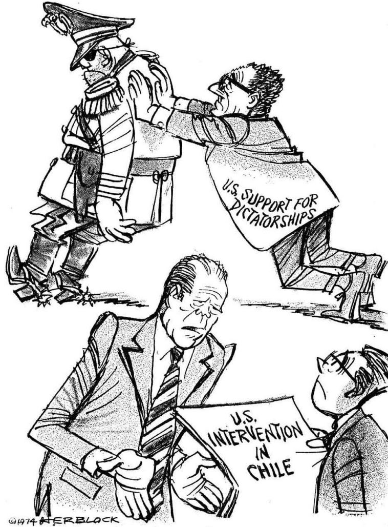
A 1974 Herblock Cartoon, © The Herb Block Foundation

“It’s common practice to interfere with other governments — if they’re elected, that is”