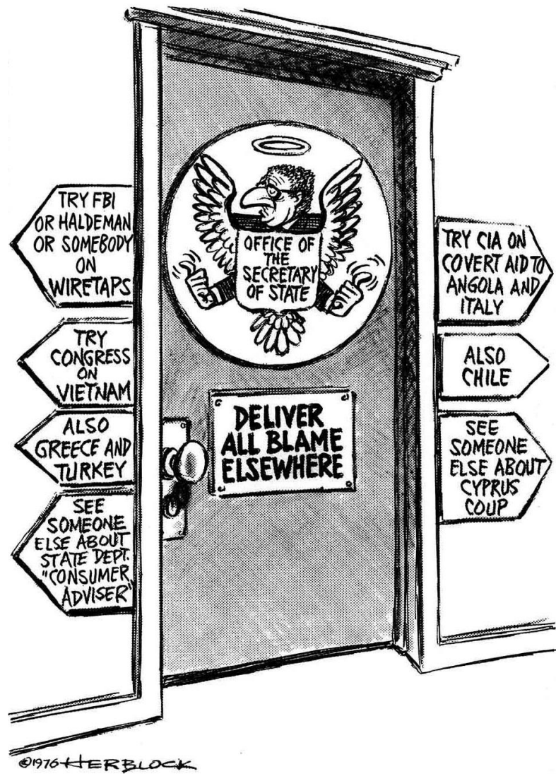
"A 1976 Herblock Cartoon, © The Herb Block Foundation"

Block, Herbert. "Thank goodness, I have an expert navigator like you, Henry, or I'd be in trouble." Drawing. January 1, 1976. From Library of Congress Prints and Photographs Division: Cartoon Drawings: Herblock Collection. http://www.loc.gov/pictures/item/2012638441/ .