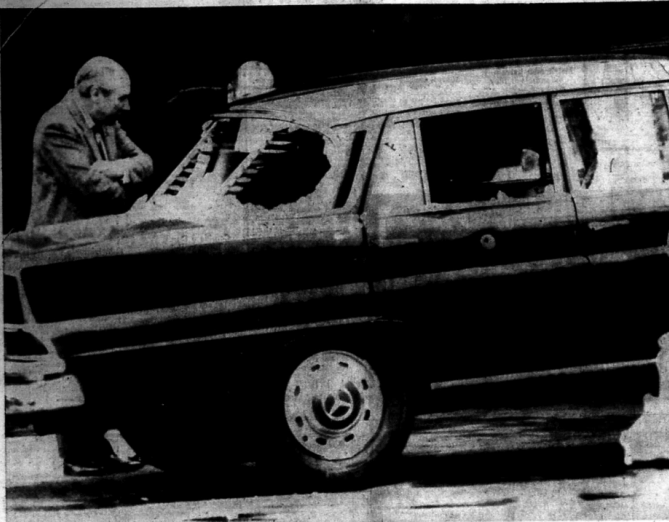
En sus vidrios laterales y posterior totalmente destruidos el automóvil Mercedes Benz...