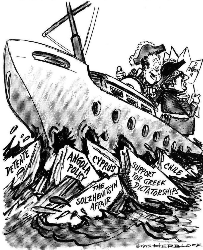
A 1976 Herblock Cartoon

"THANK GOODNESS I HAVE AN EXPERT NAVIGATOR LIKE YOU, HENRY, OR I'D BE IN TROUBLE"