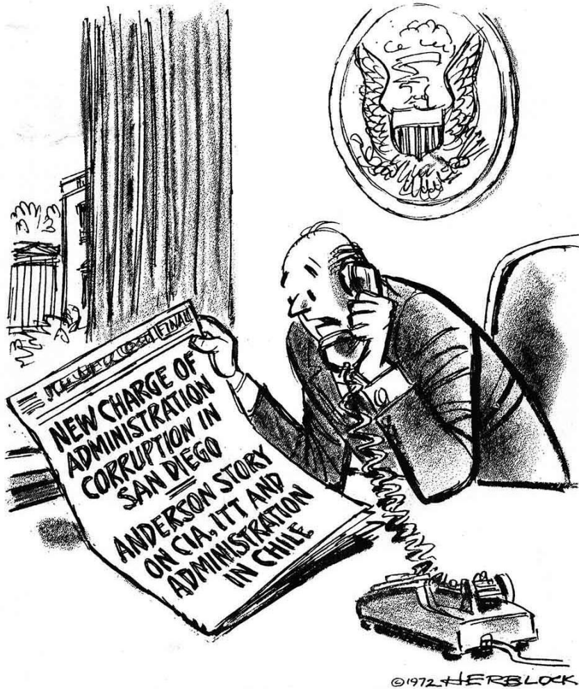
A 1972 Herblock Cartoon, © The Herb Block Foundation

“First The Good News, Mr. President — You Wanted That $400,000 Contribution Story Off The Front Pages ...”