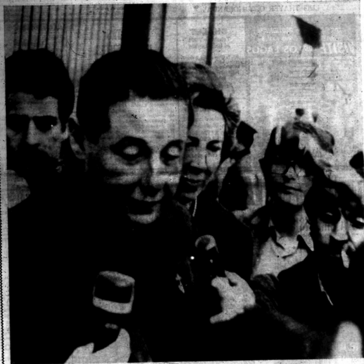
El sacerdote que ayer ofició una misa por el restablecimiento del general René Schneider...

Afirma la Policía.- Bien Encaminadas las Pesquisas