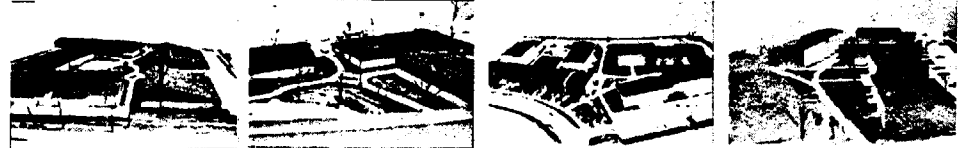
FIGURE 1 - TWO EXAMPLES FOR EACH OF THE EXPERIMENTAL CONDITIONS FOR EACH SITE