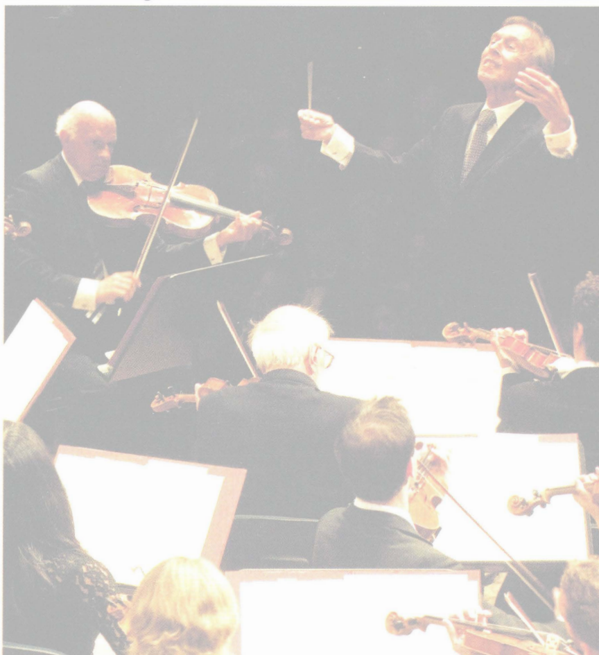
Claudio Abbado conducting the Lucerne Festival Orchestra, one of the many ensembles he founded