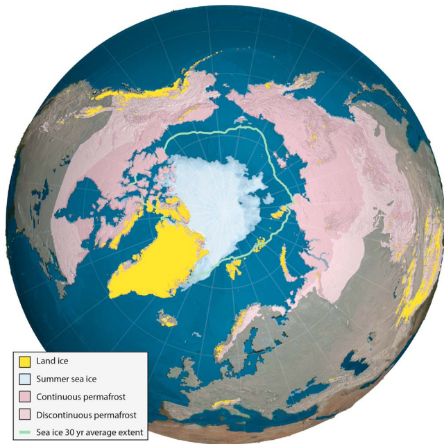
Figure 1. Land ice, summer sea ice, and permafrost in the Northern Hemisphere.

2017). The impact of permafrost thaw goes beyond the Arctic because the large amount of biomass carbon contained in permafrost is beginning to decompose and release carbon dioxide and methane to the atmosphere (Schuur et al., 2008). These added greenhouse gases further heat the atmosphere, setting up a self-reinforcing cycle, or feedback, of thawing and heating. Data analyses of permafrost soils up to 3-m depth estimate the potential carbon pool to be as much as 1,035 \pm 150 Pg (1 Pg = 1 Gt; Hugelius et al., 2014; Schuur et al., 2015), with another 425–565 Pg C contained in permafrost deeper than 3 m (Strauss et al., 2017). This pool is climate sensitive and large; soils in all other biomes combined are thought to comprise \sim 2,050 Pg C in the top 3 m. The total permafrost carbon pool (1,460–1,600 Pg C) contains about twice as much carbon as the Earth's current atmosphere (Schuur et al., 2018). A release of 10% of the permafrost carbon pool as carbon dioxide and methane would be of similar magnitude as emissions from land use change (currently 1.3 \pm 0.7 Pg C/year) thereby providing a substantial contribution to future greenhouse gas release (Le Quééré et al., 2018).