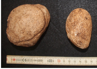
Figure C.218 Ground stone Tz-5-5-N38E38 1.1 (72)