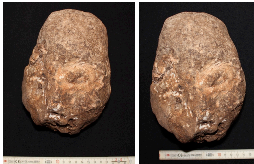
Figure C.124 Possible sculpture (human head?) Tz-3-6C-N26E20-4.1