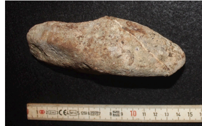
Figure C.238 Ground stone found on the surface of the kancab walkway (93)