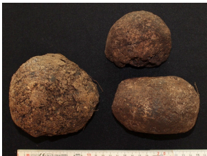
Figure C.84 Ground stone Tz-3-6A-N22E24-1.1