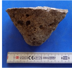
Figure C.32 Metate fragment Tz-1 N20E16 1.1