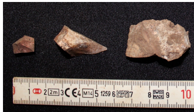
Figure C.49 Chipped stone Tz-3-6A-N20E24-2.1