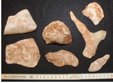
Figure C.173 Stone cutting debris Tz-4-T4-N30E10 1.1