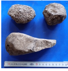
Figure C.38 Ground stone Tz-1 N20E18 1.1