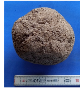
Figure C.39 Ground stone Tz-1 (out of context)