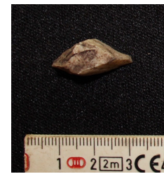
Figure C.53 Chipped stone Tz-3-6C-N24E22-1.1