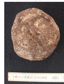
Figure C.154 Ground stone Tz-5-4-N18E40 1.1 (26)