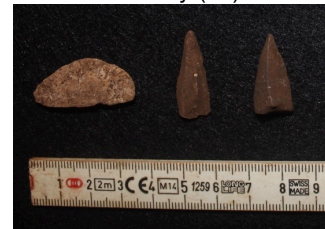
Figure C.241 Lithics Tz-5-3-N30E34 1.1 (94)