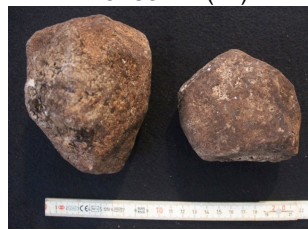
Figure C.153 Ground stone Tz-5-4-N22E44-1.1 (25)