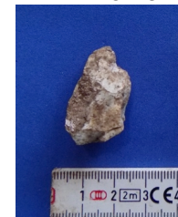
Figure C.12 Chipped stone Tz-1 N22E18 3.1