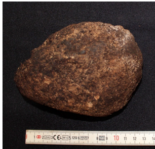
Figure C.96 Ground stone (P2) Tz-3-6B-N25E26-1.1