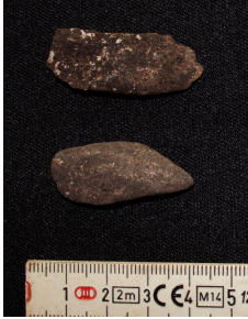
Figure C.75 Ground stone Tz-3-6A-N18E20-1.1