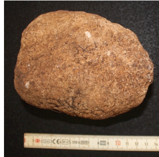
Figure C.189 Ground stone Tz-6-8A-N16E16 2.3 (51)