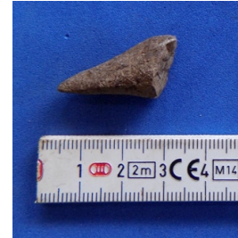
Figure C.36 Ground stone Tz-1 N26E18 1.4