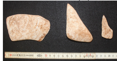
Figure C.226 Lithics Tz-4-T7-N12E10 1.1 (80)