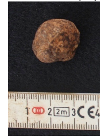
Figure C.229 Ground stone Tz-5-4-N20E34 1.1 (83)