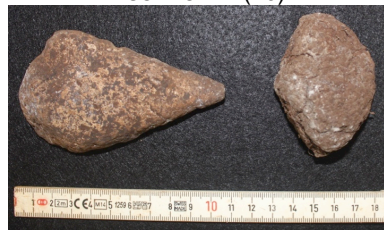
Figure C.186 Ground stone Tz-5-5- N29E36 1.1 (49)