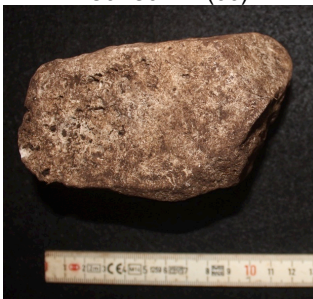
Figure C.215 Ground stone Tz-5-5-N26E28 2.1 (69)