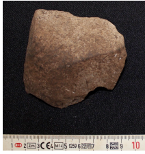
Figure C.45 Chipped stone Tz-3-1-N14W20-1.2