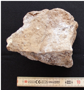
Figure C.78 Cuña Tz-3-6A-N18E22-2.1