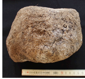
Figure C.91 Metate fragment Tz-3-6C-N24E20-2.2