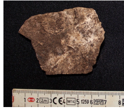
Figure C.46 Chipped stone Tz-3-1-N22W14-2.1