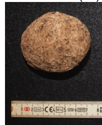
Figure C.198 Ground stone Tz-6-8A-N16E16 1.1 (60)