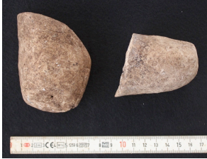
Figure C.134 Ground stone Tz-5-3-N38E32 1.1 (8)