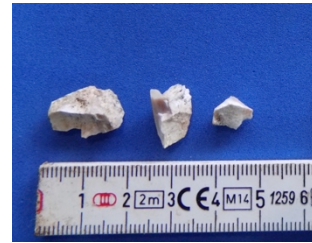
Figure C.3 Chipped stone Tz-1 N22E18 2.1