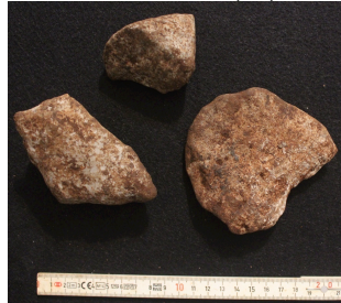
Figure C.207 Ground stone Tz-6-3A-N24E20 1.1 (66)