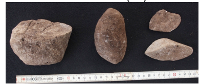
Figure C.139 Ground stone Tz-5-3-N26E36-1.1 (13)