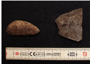
Figure C.63 Lithics Tz-3-6B-N25E26-1.2