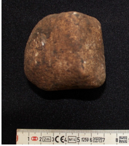
Figure C.72 Ground stone Tz-3-1-N16W12-2.1