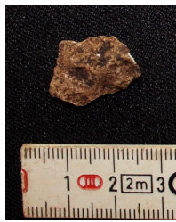
Figure C.52 Chipped stone Tz-3-6A-N17E20-24-1.1