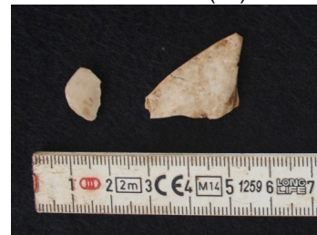
Figure C.232 Chipped stone Tz-5-3-N26E32 1.1 (87)