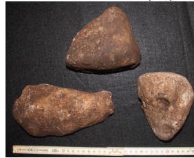
Figure C.210 Ground stone Tz-5-4-N26E40 2.1 (29)