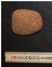
Figure C.239 Ground stone found on the surface of the kancab walkway (93)