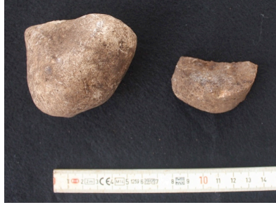
Figure C.129 Ground stone Tz-5-3-N32E36 1.1 (3)