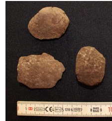
Figure C.65 Ground stone Tz-3-1-N12W16-1.1