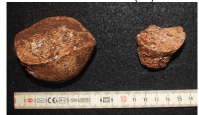
Figure C.199 Ground stone Tz-6-8A-N14E16 5.1 (61)