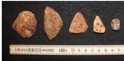
Figure C.243 Ground stone Tz-5-3- N28E42 1.1 (95)