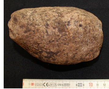
Figure C.77 Ground stone Tz-3-6A-N18E22-1.2