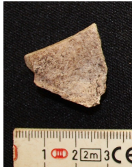
Figure C.64 Lithics Tz-3-7-N22E20-1.1