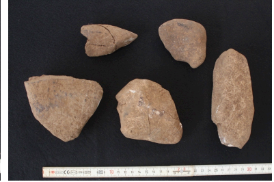
Figure C.145 Ground stone Tz-5-3-N30E30 1.1 (18)