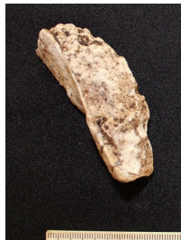
Figure C.115 Cuña Tz-3-7-N26E20-2.1