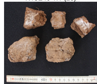
Figure C.157 Burned stones Tz-4-T2-N10E10 1.1