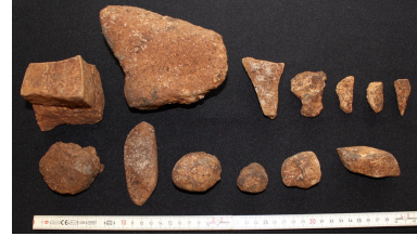
Figure C.119 Ground stone Tz-4-T1-N20E32-1.1