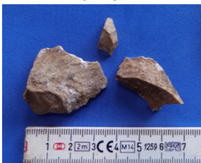
Figure C.7 Chipped stone Tz-1 N18E16 2.1