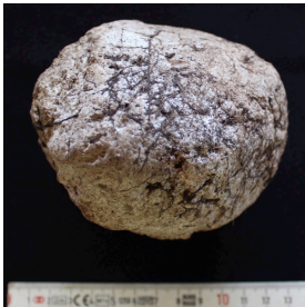
Figure C.108 Ground stone Tz-3-6C-N26E20-2.2