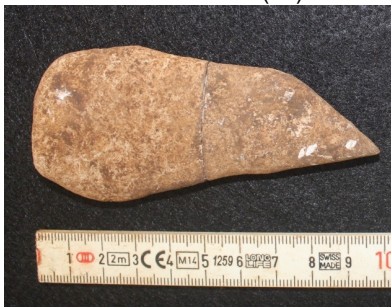
Figure C.230 Lithic Tz-5-3-N32E32 1.1 lítica (85)