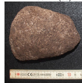
Figure C.217 Ground stone Tz-5-5-N30E22 1.1 (71)