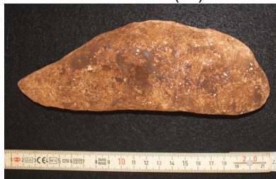
Figure C.179 Ground stone Tz-6- 3A-N22E22 1.1 (42)