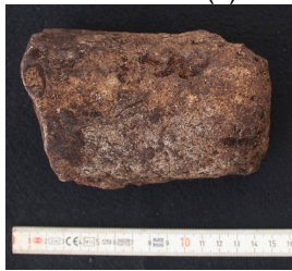
Figure C.137 Ground stone Tz-5-3-N32E38 1.1 (11)