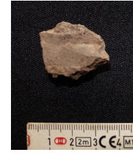
Figure C.47 Chipped stone Tz-3-6C-N24E20-3.1