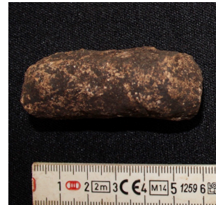
Figure C.80 Ground stone Tz-3-6A-N20E20-1.2