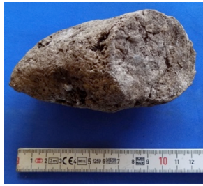
Figure C.17 Ground stone Tz-1 N14E18 1.1