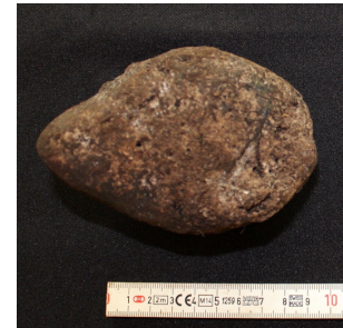
Figure C.98 Ground stone (P5) Tz-3-6B-N25E26-1.1