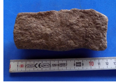
Figure C.15 Ground stone Tz-1 N16E18 4.1