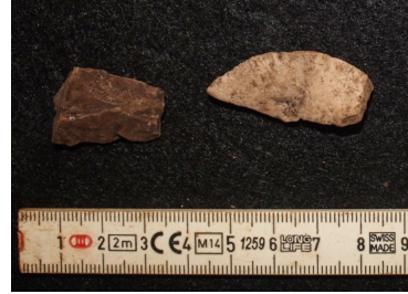
Figure C.205 Ground stone Tz-5-1-N18W22 1.1 (65)