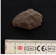
Figure C.42 Chipped stone Tz-3-1-N12W16-1.1