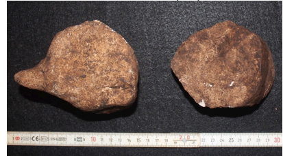
Figure C.208 Ground stone Tz-54-N26E40 2.1 (29)