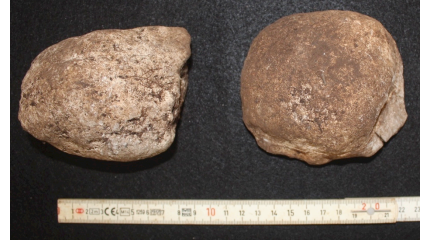
Figure C.175 Ground stone Tz-6- 8A-N16E14 2.1 (39)