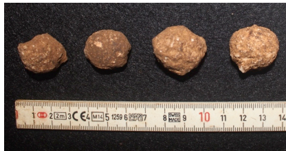
Figure C.240 Ground stone found on the surface of the kancab walkway (93)