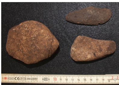
Figure C.183 Ground stone Tz-5-5- N38E28 1.1 (46)