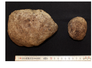
Figure C.83 Ground stone Tz-3-6A-N22E22-1.1