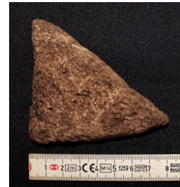
Figure C.68 Ground stone Tz-3-1-N14W12-1.1