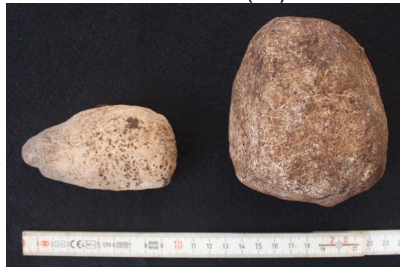
Figure C.141 Ground stone Tz-5-3-N32E40 1.1 (14)