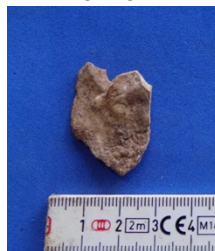
Figure C.8 Chipped stone Tz-1 N18E20 4.1