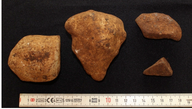
Figure C.117 Ground stone Tz-4-T1-N20E28