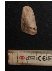
Figure C.244 Lithic Tz-5-3-N34E32 1.1 (96)