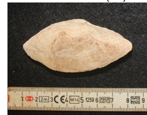
Figure C.196 Ground stone Tz-4-T4-N16E10 1.1 (58)