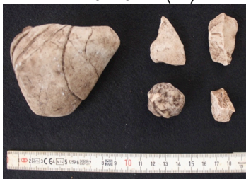
Figure C.152 Ground stone Tz-5-4-N24E40 2.1 (24)