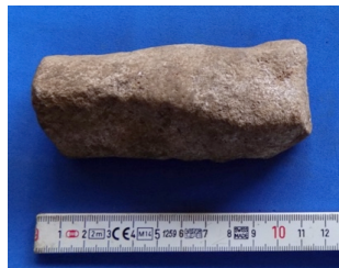
Figure C.26 Ground stone Tz-1 N16E18 4.1