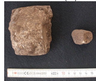
Figure C.151 Ground stone Tz-5-4-N20E38 1.1