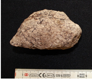
Figure C.87 Ground stone Tz-3-6C-N24E20-1.1