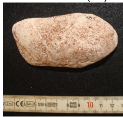
Figure C.194 Ground stone Tz-4-T3-N10E34 1.1 (56)