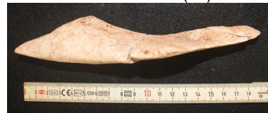
Figure C.170 Ground stone Tz-4-T4-N30E10 1.1 (34)