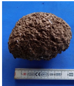
Figure C.23 Ground stone Tz-1 N16E18 1.1