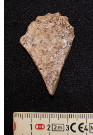
Figure C.61 Chipped stone Tz-3-6C-N26E22-2.2