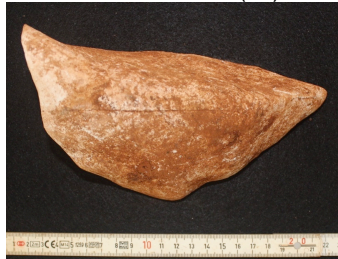
Figure C.162 Ground stone Tz-4-T4-N24E10 1.1 (32)