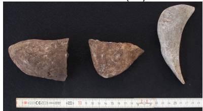
Figure C.142 Ground stone Tz-5-3-N34E40 1.1 (15)