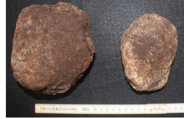
Figure C.220 Ground stone Tz-5-5-N32E28 1.1 (74)