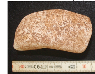
Figure C.168 Ground stone Tz-4-T5-N32E10 1.1 (33)