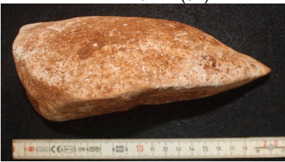
Figure C.164 Ground stone Tz-4-T4-N24E10 1.1 (32)