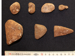
Figure C.118 Ground stone Tz-4-T1-N20E30-1.1