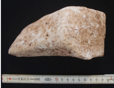
Figure C.158 Ground stone Tz-4-T4-N30E10 1.1 (31)