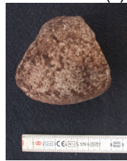
Figure C.138 Ground stone Tz-5-3-N30E34 1.1 (12)