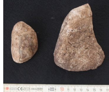
Figure C.130 Ground stone Tz-5-3-N26E34 1.1 (4)