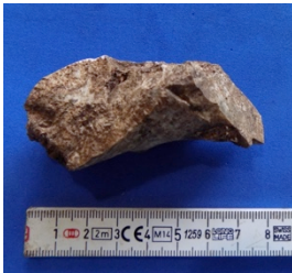
Figure C.4 Chipped stone Tz-1 N16E18 2.2