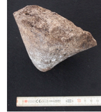
Figure C.136 Metate foot Tz-5-3-N28E36 1.1 (10)