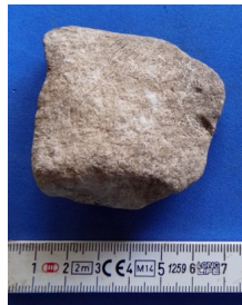
Figure C.20 Ground stone Tz-1 N16E12 1.3