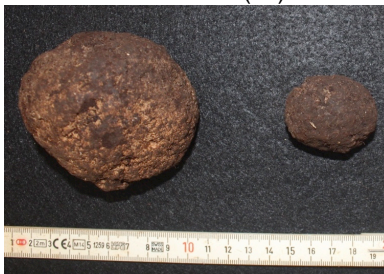
Figure C.180 Ground stone Tz-5-5- N40E28 1.1 (43)