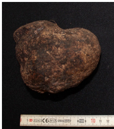
Figure C.111 Ground stone Tz-3-6-N26E24-1.2