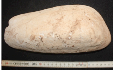
Figure C.174 Ground stone Tz-4- T4-N28E10 1.1 (37)