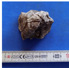
Figure C.11 Chipped stone Tz-1 N20E18 1.1