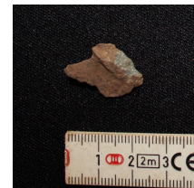
Figure C.56 Chipped stone Tz-3-6-N24E24-3.3