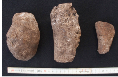
Figure C.144 Ground stone Tz-5-3-N34E38-1.1 (17)