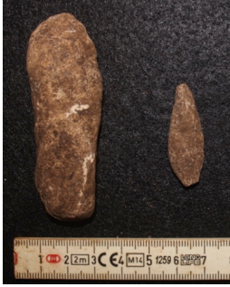
Figure C.203 Ground stone Tz-5-1-N18W28 1.1 (64)