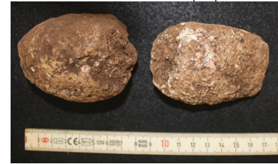
Figure C.178 Ground stone Tz-5-2- N30E22 1.1 (41)