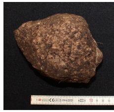
Figure C.85 Ground stone Tz-3-6-N22E26-1.1