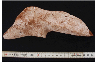
Figure C.225 Ground stone Tz-4-T7-N14E10 1.1 (79)