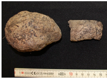
Figure C.112 Ground stone Tz-3-6C-N28E20-1.1