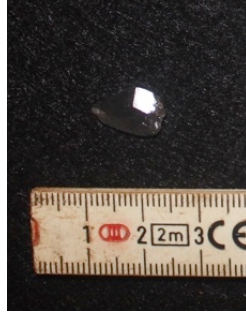
Figure C.249 Obsidian Tz-5-3- N32E38 1.1