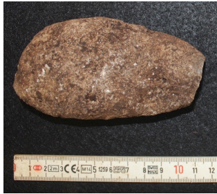
Figure C.176 Ground stone Tz-5-5- N30E22 1.2 (40)