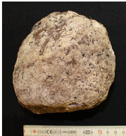
Figure C.105 Ground stone Tz-3-6C-N26E20-1.2