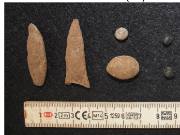
Figure C.231 Lithics Tz-5-3-N28E28 1.1 (86)