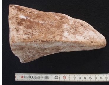
Figure C.159 Ground stone Tz-4-T4-N30E10 1.1 (31)