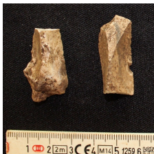
Figure C.54 Chipped stone Tz-3-1-N20W12-2.1