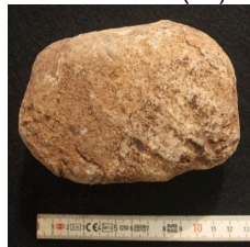
Figure C.213 Ground stone Tz-5-1 (67)