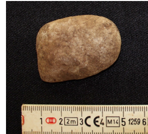
Figure C.71 Ground stone Tz-3-1-N14W18-1.1