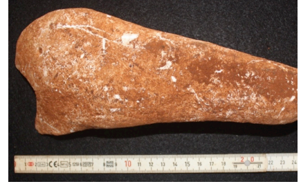
Figure C.160 Ground stone Tz-4-T4-N24E10 1.1 (32)