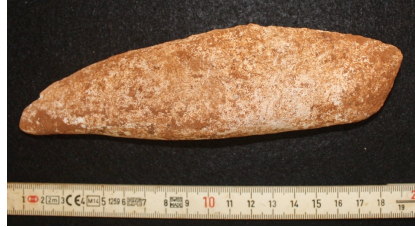
Figure C.192 Ground stone Tz-4-T4-N30E10 1.1 (54)