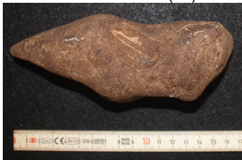
Figure C.197 Ground stone Tz-5-1-N12W20 1.1 (59)