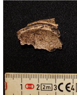
Figure C.122 Marine shell Tz-3-6B-N25E26-1.2