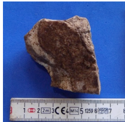
Figure C.5 Chipped stone Tz-1 N18E18 2.1