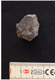
Figure C.69 Chipped stone Tz-3-6C-N25E22-2.1