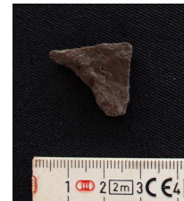
Figure C.50 Chipped stone Tz-3-6C-N24E22-1.1