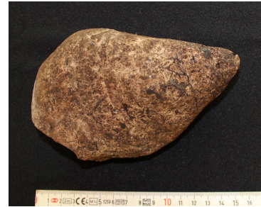
Figure C.95 Ground stone (P1) Tz-3-6B-N25E26-1.1