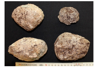
Figure C.86 Ground stone Tz-3-6C-0.0