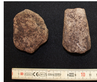
Figure C.113 Ground stone Tz-3-6C-N28E20-1.2