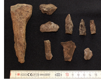
Figure C.44 Chipped stone Tz-3-6-N22E20-1.1