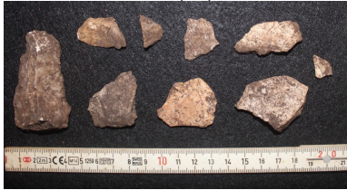
Figure C.236 Chipped stone Tz-5-1- N10W20 1.1