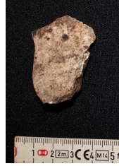
Figure C.43 Chipped stone Tz-3-1-N20W16-1.1