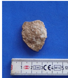
Figure C.2 Chipped stone Tz-1 N18E16 3.1