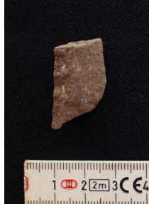
Figure C.58 Chipped stone Tz-3-6C-N26E20-4.2