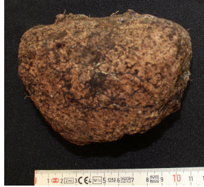
Figure C.103 Ground stone (P9) Tz-3-6B-N25E26-1.2