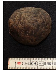
Figure C.110 Ground stone Tz-3-6C-N26E22-2.1