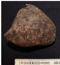
Figure C.114 Ground stone Tz-3-6C-N28E20-1.3