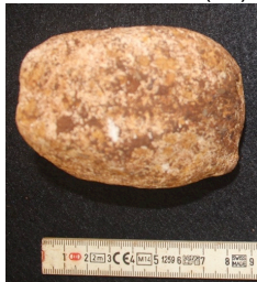
Figure C.227 Ground stone Tz-4-T3-N10E36 1.1 (81)