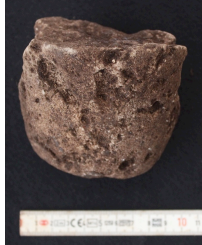
Figure C.135 Ground stone Tz-5-3-N36E38 1.1 (9)