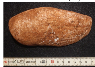
Figure C.165 Ground stone Tz-4-T4-N24E10 1.1 (32)