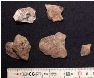
Figure C.66 Chipped stone Tz-3-6B-N25E26-1.2