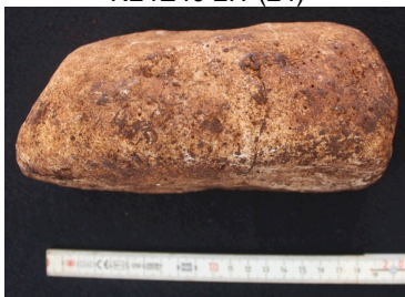
Figure C.155 Ground stone Tz-5-4-N22E20 2.1 (27)