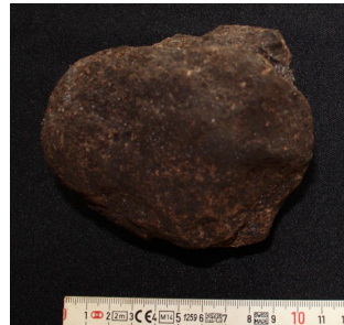
Figure C.97 Ground stone (P3) Tz-3-6B-N25E26-1.1