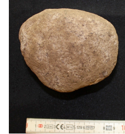
Figure C.92 Ground stone Tz-3-6C-N24E20-4.1