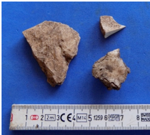
Figure C.1 Chipped stone Tz-1 N16E18 2.1

Artifacts of the 2015 season (see Appendix E for excavation contexts)