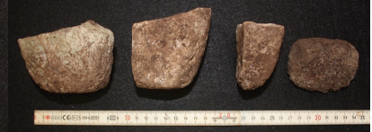
Figure C.193 Ground stone Tz-5-1N12W23 1.1 (55)