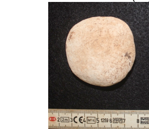
Figure C.172 Ground stone Tz-4-T3-N10E36 1.1 (38)