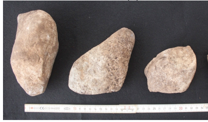
Figure C.132 Ground stone Tz-5-3-N24E36 1.1 (6)