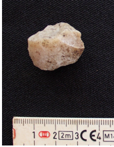
Figure C.57 Chipped stone Tz-3-6B-N24E26-1.2