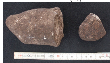
Figure C.156 Ground stone Tz-5-4-N22E40 2.1 (28)