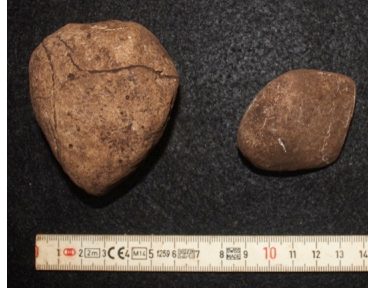
Figure C.204 Ground stone Tz-5-1-N18W28 1.1 (64)