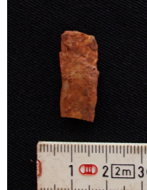
Figure C.62 Chipped stone Tz-5-P2-3.1