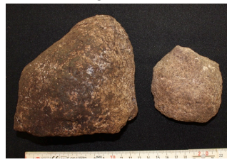
Figure C.82 Ground stone Tz-3-6-N22E20-1.1