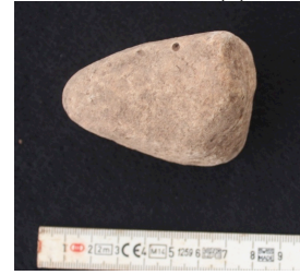
Figure C.133 Ground stone Tz-5-3-N30E31 1.1 (7)