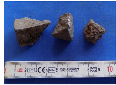
Figure C.21 Possible volcanic stones Tz-1 N16E20 1.1