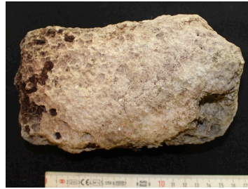
Figure C.94 Ground stone Tz-3-6C-N25E22-1.1