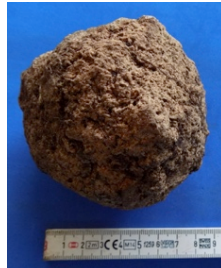
Figure C.41 Ground stone Tz-1 N20E20 1.1

Artifacts of the 2016 season (see Appendix E for excavation contexts)