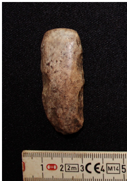
Figure C.123 Green stone celt Tz-3-6B-N26E26-1.1