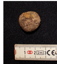
Figure C.116 Ground stone I Tz-3-7-N28E20-1.2