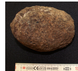
Figure C.101 Ground stone (P7) Tz-3-6B-N25E26-1.2