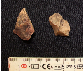
Figure C.60 Chipped stone Tz-3-6B-N24E26-2.1