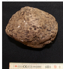
Figure C.100 Ground stone Tz-3-6B-N25E26-1.2