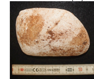
Figure C.171 Ground stone Tz-4-T7-N10E10 1.1 (35)