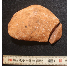
Figure C.222 Ground stone Tz-4-T7-N14E10 1.1 (76)