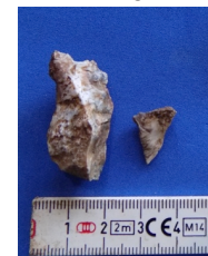
Figure C.9 Chipped stone Tz-1 N22E18 2.3