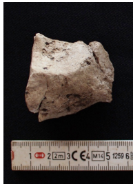
Figure C.67 Chipped stone Tz-3-7-N24E19-1.1