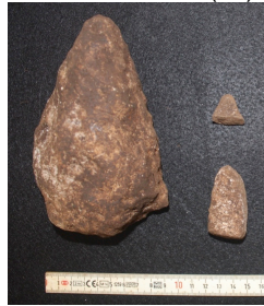
Figure C.177 Ground stone Tz-5-5- N30E22 1.2 (40)