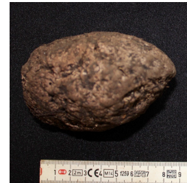
Figure C.107 Ground stone Tz-3-6C-N26E20-2.1