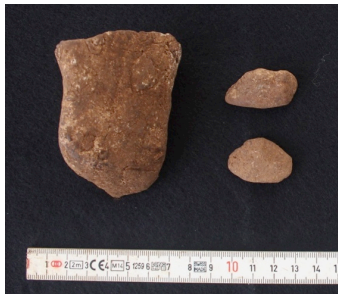
Figure C.125 Ground stone Tz-5-3-N30E40 2.1 (1)