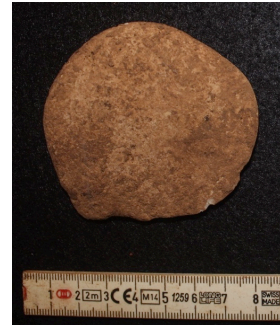
Figure C.235 Ground stone Tz-5-3- N32E32 1.2