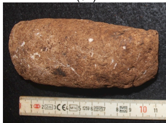
Figure C.216 Ground stone Tz-5-5-N26E34 1.1 (70)