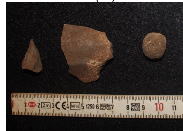
Figure C.247 Ground stone Tz-5-3- N32E30 1.1 (98)