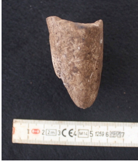
Figure C.128 Ground stone Tz-5-3-N32E38 1.1 (2)