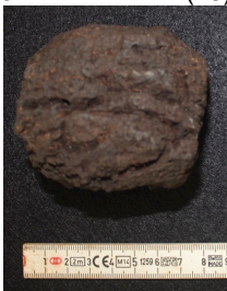
Figure C.185 Ground stone Tz-5-5- N36E26 2.1 (48)