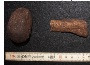
Figure C.214 Ground stone Tz-5-1-N14W08 1.1 (68)