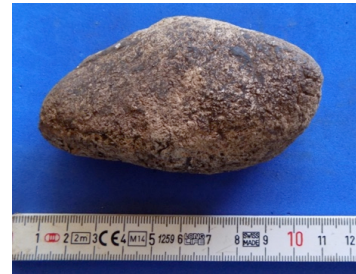
Figure C.18 Ground stone Tz-1 N16E20 1.1