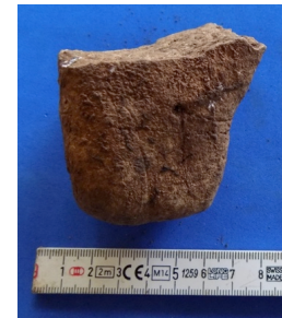
Figure C.24 Metate foot Tz-1 N18E12 2.2