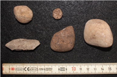
Figure C.206 Ground stone Tz-5-1-N18W22 1.1 (65)