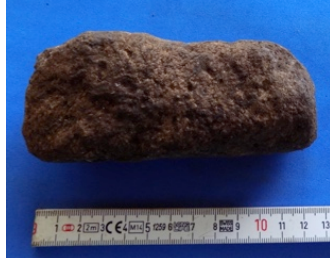
Figure C.29 Ground stone Tzacaul Tz-1 N18E22 2.1