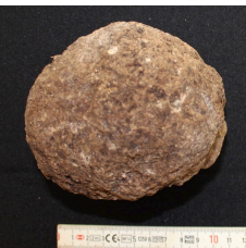
Figure C.81 Ground stone Tz-3-6A-N20E22-4.1