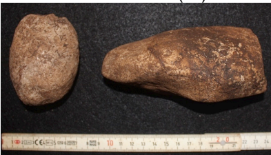
Figure C.212 Ground stone Tz-5-3-N36E30 1.1 (66)