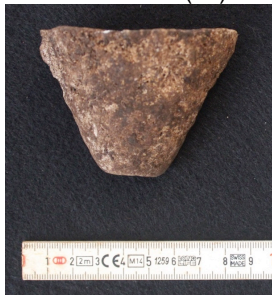
Figure C.149 Metate fragment Tz-5-4-N16E40 1.1 (21)