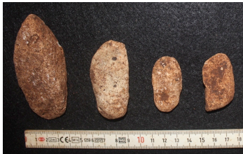
Figure C.242 Ground stone Tz-5-3- N28E42 1.1 (95)