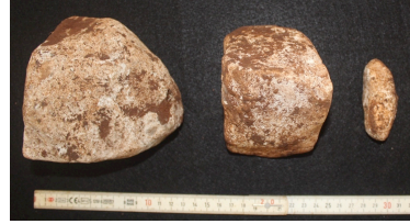
Figure C.223 Ground stone Tz-6-3A-N24E20 1.1 (77)