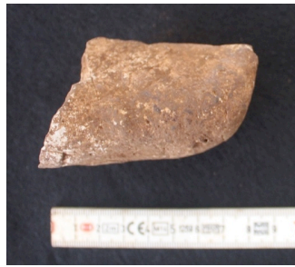
Figure C.126 Ground stone Tz-5-3-N30E40 2.1 (1)