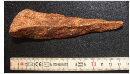
Figure C.190 Ground stone Tz-6-8A-N16E14 3.1 (52)