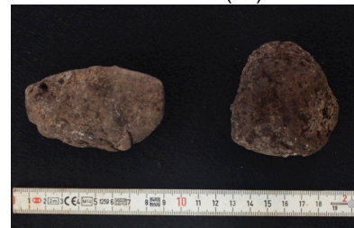
Figure C.181 Ground stone Tz-5-5- N38E32 1.1 (44)