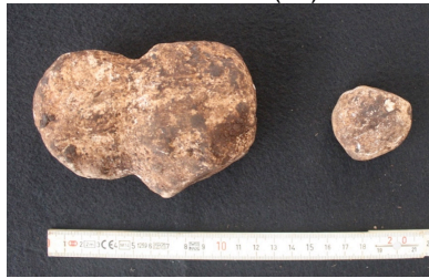
Figure C.147 Ground stone Tz-5-4-N16R40 1.1 (20)