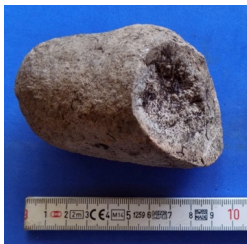
Figure C.25 Ground stone Tz-1 N10E14 1.1