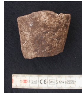
Figure C.127 Ground stone Tz-3-5-N32E38 1.1 (2)