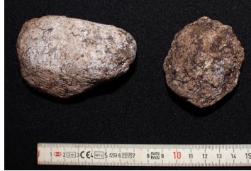
Figure C.76 Ground stone Tz-3-6A-N18E21-2.2