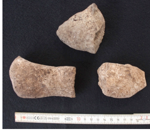
Figure C.143 Ground stone Tz-5-3-N26E30 1.1 (16)