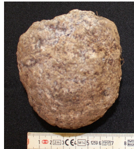
Figure C.79 Ground stone Tz-3-6A-N18E22-2.1