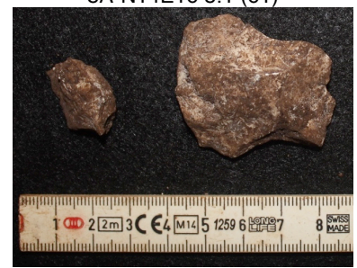
Figure C.202 Lithics Tz-5-1-N18E28 1.1 (64)