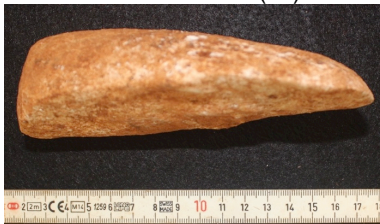
Figure C.167 Ground stone Tz-4-T4-N24E10 1.1 (32)