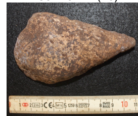
Figure C.187 Ground stone Tz-5-5- N29E36 1.1 (49)