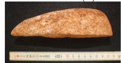
Figure C.166 Ground stone Tz-4-T4-N24E10 1.1 (32)