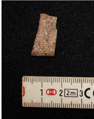
Figure C.120 Marine shell Tz-3-6-N26E24-1.2