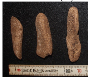
Figure C.246 Ground stone Tz-5-3- N32E30-1.1 (98)