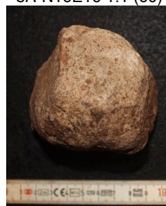
Figure C.201 Ground stone Tz-5-1-N12W08 1.1 (63)