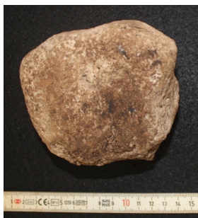
Figure C.182 Ground stone Tz-6- 8A-N14E14 1.1 (45)