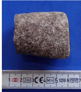
Figure C.35 Ground stone Tz-1 N20E18 Superficie