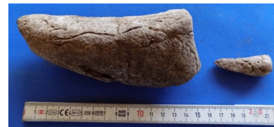
Figure C.27 Ground stone Tz-1 N18E16 2.1