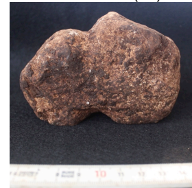
Figure C.148 Ground stone Tz-5-4-N16R40 1.1 (20)