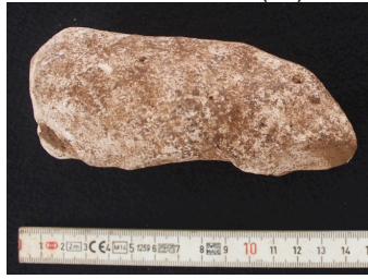
Figure C.228 Ground stone Tz-4-T5-N12E10 1.1 (82)