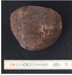
Figure C.131 Ground stone Tz-5-3-N32E38 1.1 (5)