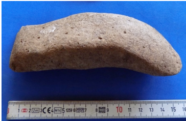
Figure C.31 Ground stone Tz-1 N18E16 2.2