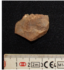
Figure C.70 Chipped stone Tz-5-P1-1.2