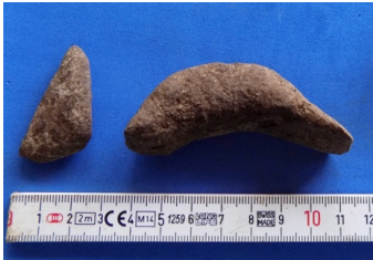
Figure C.40 Ground stone Tz-1 N18E22 1.1