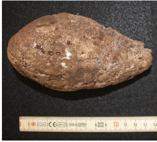
Figure C.188 Ground stone Tz-5-5-N22E28 1.1 (50)