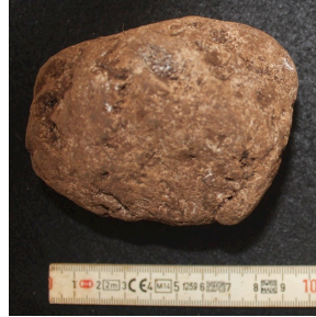
Figure C.219 Ground stone Tz-5-5-N26E24 1.1 (73)