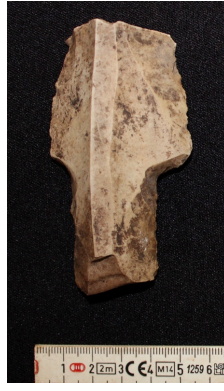
Figure C.121 Chipped stone Tz-3-6C-N24E20-2.2