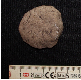
Figure C.90 Ground stone Tz-3-6C-N24E20-2.2