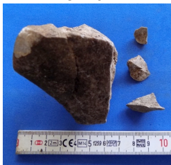
Figure C.10 Chipped stone Tz-1 N18E16 2.1