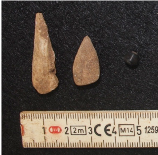
Figure C.233 Lithics Tz-5-3-N30E30 1.1 (88)