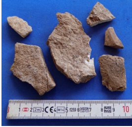
Figure C.28 Possible lithics Tz-1 N18E16 2.1