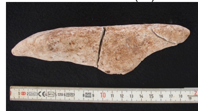
Figure C.169 Ground stone Tz-4-T4-N30E10 1.1 (34)