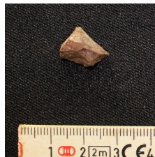
Figure C.55 Chipped stone Tz-3-6A-N20E21-4.2