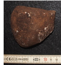
Figure C.211 Ground stone Tz-5-4-N26E40 2.1 (29)