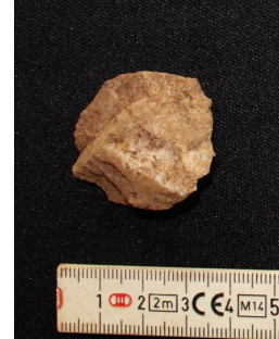
Figure C.59 Chipped stone Tz-5-P2-2.1