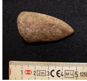
Figure C.73 Ground stone Tz-3-1-N18W14-1.1