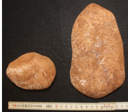
Figure C.221 Ground stone Tz-4-T5-N14E10 1.1 (75)