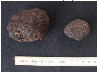
Figure C.146 Ground stone Tz-5-5-N40E26 1.1 (19)