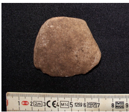
Figure C.51 Chipped stone Tz-3-1-N18W16-1.1