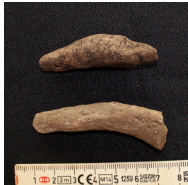
Figure C.106 Ground stone Tz-3-6C-N26E20-2.1