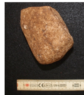
Figure C.184 Ground stone Tz-5-5- N38E28 1.1 (46)