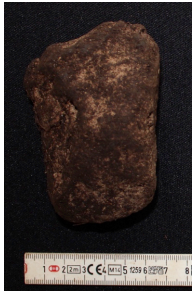
Figure C.93 Ground stone (P4) Tz-3-6B-0.0