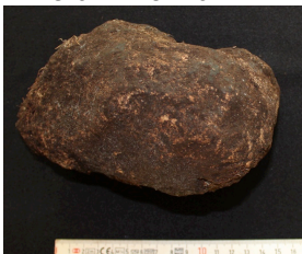
Figure C.99 Ground stone (P6) Tz-3-6B-N25E26-1.1