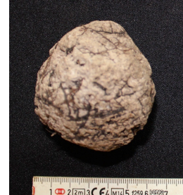
Figure C.89 Ground stone Tz-3-6C-N24E20-2.1