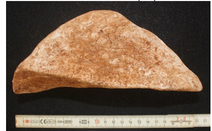
Figure C.163 Ground stone Tz-4-T4-N24E10 1.1 (32)