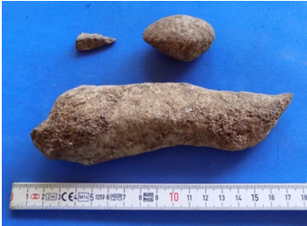
Figure C.34 Ground stone Tz-1 N18E18 2.1