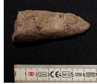
Figure C.74 Ground stone Tz-3-1-N18W18-1.1