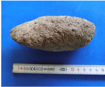
Figure C.37 Ground stone Tz-1 N18E20 4.1