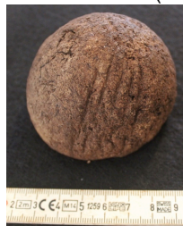
Figure C.195 Ground stone Tz-5-1-N24W22 1.1 (57)