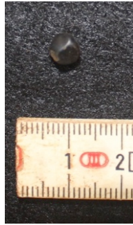
Figure C.234 Lithic Tz-5-3-N30E30 1.1 (88)