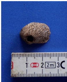
Figure C.22 Marine shell Tz-1 N16E14 1.1