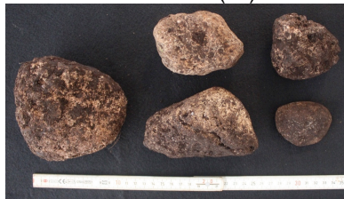
Figure C.150 Ground stone Tz-5-4-N18E38 1.1 (22)