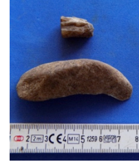
Figure C.30 Ground stone Tz-1 N22E18 2.1