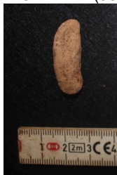
Figure C.245 Ground stone Tz-5-3- N30E36 1.1 (97)