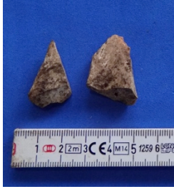
Figure C.13 Chipped stone Tz-1 N24E16 1.1