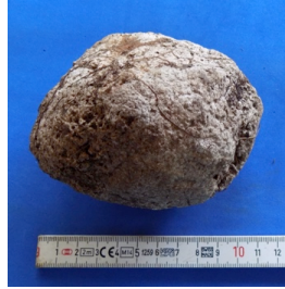
Figure C.14 Ground stone Tz-1 N10E16 1.1