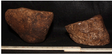
Figure C.209 Metate fragments Tz-54-N26E40 2.1 (29)