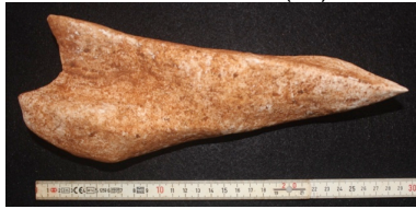
Figure C.161 Ground stone Tz-4-T4-N24E10 1.1 (32)