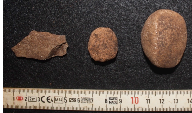
Figure C.237 Ground stone Tz-5-4- N18E42 1.1