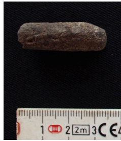
Figure C.109 Possible lithic Tz-3-6C-N26E20-4.1