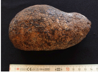
Figure C.102 Ground stone (P8) Tz-3-6B-N25E26-1.2