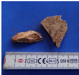
Figure C.19 Chipped stone Tz-1 N30E16 1.2