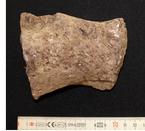
Figure C.104 Ground stone Tz-3-6C-N26E20-1.1