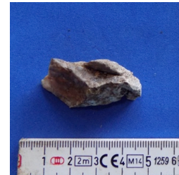
Figure C.6 Chipped stone Tz-1 N22E18 2.1