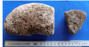
Figure C.33 Ground stone Tz-1 N22E18 2.1