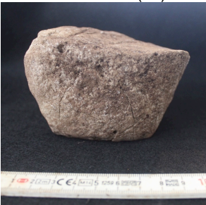
Figure C.140 Metate fragment Tz-5-3-N26E36-1.1 (13)