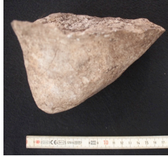
Figure C.191 Metate foot Tz-6-8A-N14E14 2.1 (53)