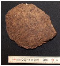
Figure C.48 Chipped stone Tz-3-1-N20W14-2.1