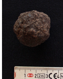
Figure C.88 Ground stone Tz-3-6-N24E20-1.2