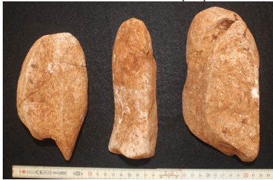
Figure C.224 Ground stone Tz-4-T4-N24E10 1.1 (78)