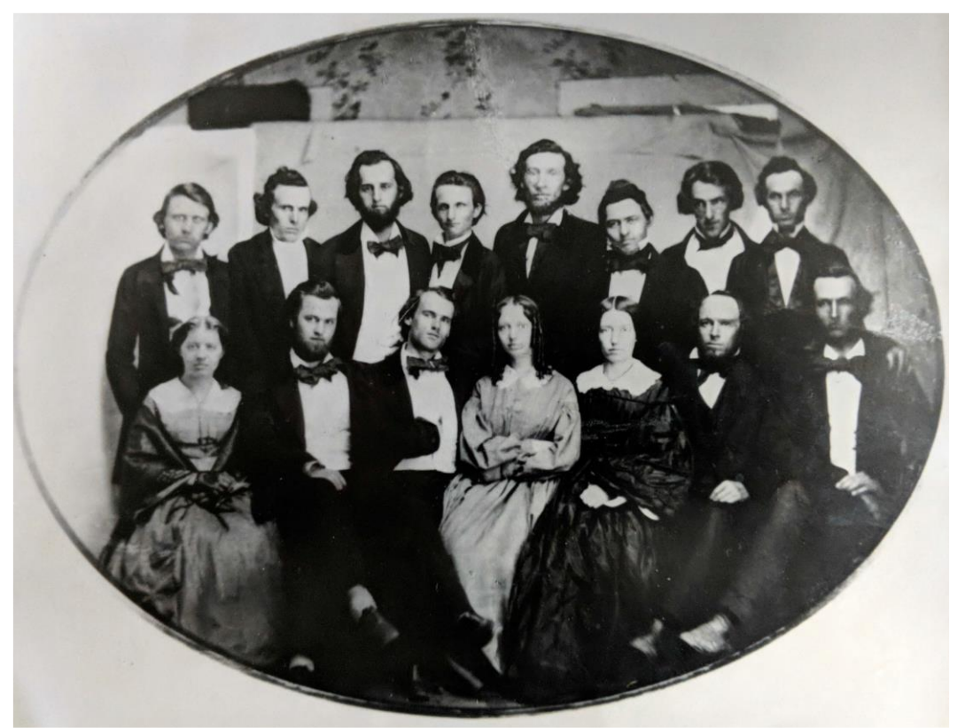
Fig. 8. Antioch Graduating Class, 1857 ("1st Graduating Class," Antiochiana).61

Refracted through these fragments, Antioch's assessment ecology comes into view—a grid of writing tasks intended both to exercise and externalize the developing student mind.