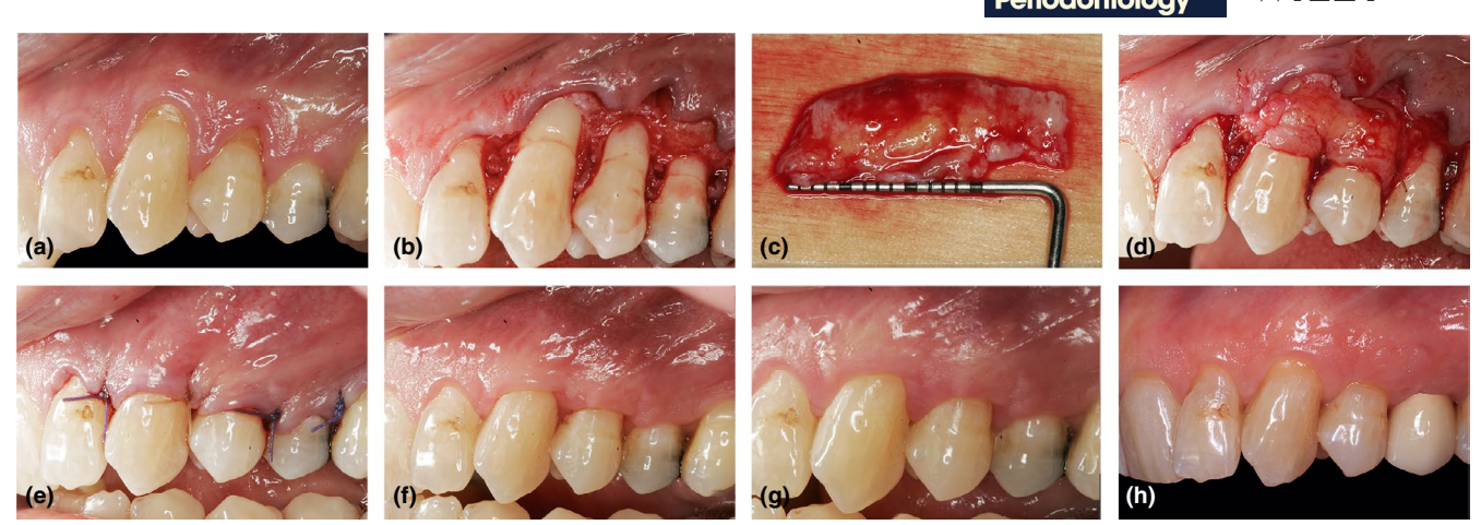
FIGURE 3 Multiple gingival recession treatment of the maxillary canine and first premolar with eCAF. A CTG was sutured over the canine and the first premolar. (a) Baseline; (b) Design of the eCAF; (c, d) CTG harvested from the palate (without a band of epithelium) and sutured over the canine and the first premolar; (e) Flap coronally advanced and sutured; (f) Healing at 3 months; (g) Healing at 6 months; (h) 12-year results