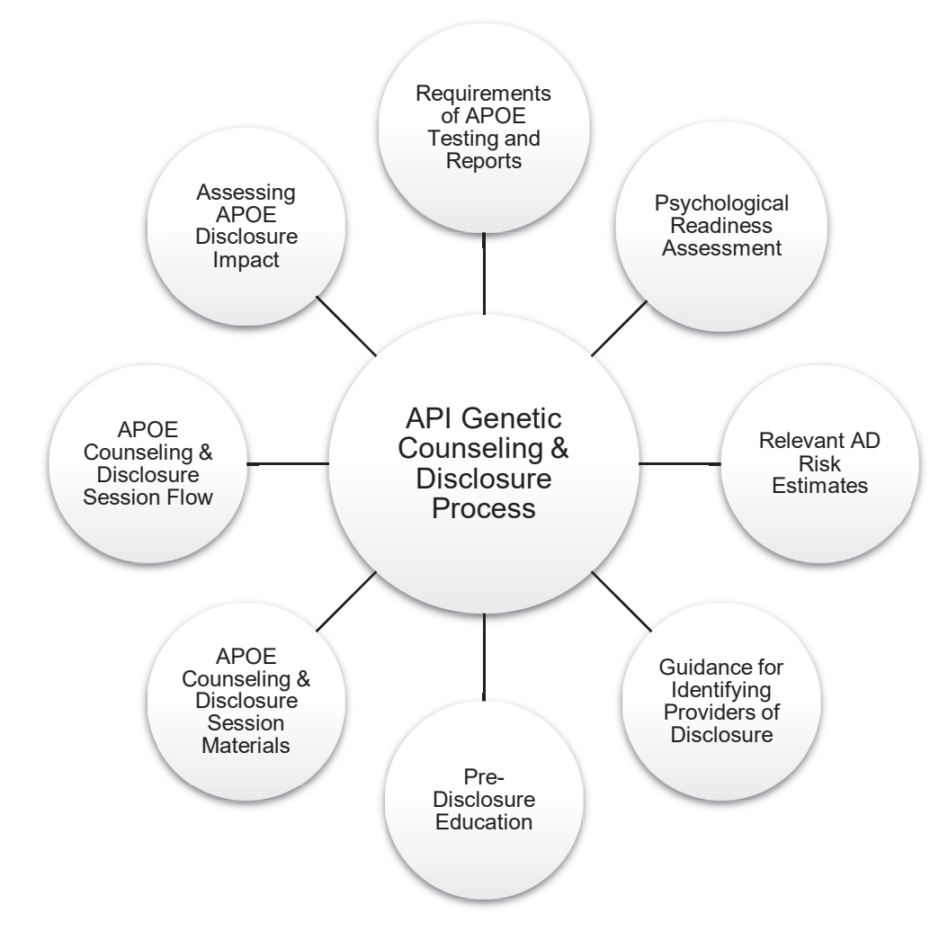
Fig. 1. Alzheimer's Prevention Initiative Genetic Counseling and Disclosure Process components. Abbreviations: APOE , apolipoprotein E; API, Alzheimer's Prevention Initiative; AD, Alzheimer's disease.