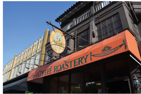
Figure 4. Chestnut Street in The Marina.

A history of affluence has molded the Marina’s contemporary socioeconomic character. After the 1906 earthquake