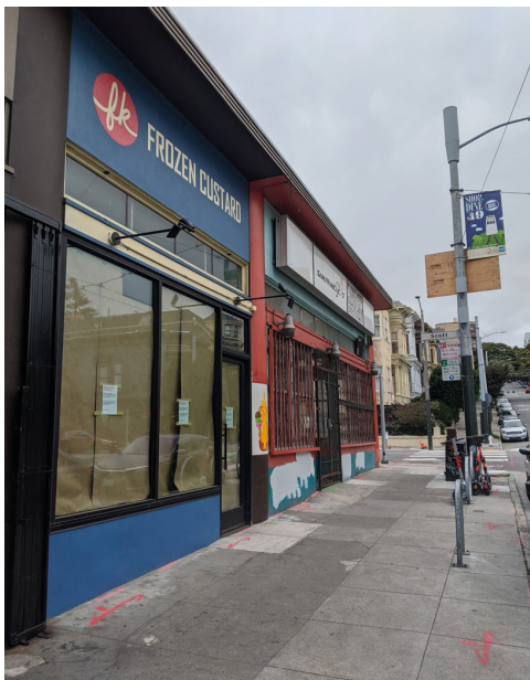
Figure 1. Vacant small businesses at Haight Street and Scott Street in San Francisco (Week, 2020).

The Mandatory Seismic Retrofit Program, passed by the City in 2013, accounts for a quarter of commercial vacancies in some San Francisco neighborhoods. 1 The program's goal to retrofit all seismically unstable buildings is imperative for the health, safety, and resiliency of San Francisco. However, just as an earthquake disturbs the city's bedrock, the ordinance disrupts the small businesses that serve as the economic and cultural foundation of many neighborhoods. Although the City intended for closures and vacancies caused by retrofitting to be temporary, the increased rents following remodels have led to enduring changes for San Francisco's small business community. I assess the impact of mandatory seismic upgrades on San Francisco's neighborhood commercial districts by analyzing three San Francisco Supervisor Districts: 1, 2, and 5, and tracking the number of businesses that closed before, during, or after the retrofit permitting process. The resulting turnover, ownership change, and vacancy rates illuminate the tension between planning for environmental resiliency and ensuring that small businesses are economically resilient.