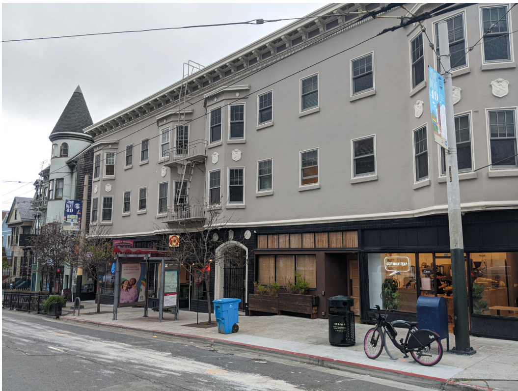
Figure 5. 'Shaken' Small Businesses at Divisadero Street and Haight Street. Prior to retrofitting, this building housed two smoke shops, a café, and three family-owned restaurants: a burger joint, a pizza-by-the slice counter, and a Korean sandwich shop. After retrofitting, only the pizza restaurant remains. An artisan coffee and tea café, 'instagrammable' bubble tea shop, sit-down sushi restaurant, and 'fusion' Indian wine bar now occupy the other spaces (Week, 2020).

Park in 1879 stimulated the residential development of the district. Wealthy families and city elites soon moved into the area to enjoy the large, open lots, the "luxuriant carriage entrance" located on today's Panhandle, and the nearby park. 23 Ashbury Street once held the moniker 'Politician's Row.' 24 Decades later, it would be famous again as the address of the Grateful Dead. The commercial corridor along Haight Street no longer caters to a bygone bourgeoisie clientele. The district's contemporary retail is spread across 41 Tier IV structures, and its 99 commercial spaces often feature bohemian businesses ranging from smoke shops to Tibetan gift and spiritual stores.