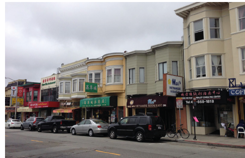
Figure 3. Clement Street in The Richmond.

Bounded by the Pacific Ocean to the west, the Presidio to the north, Arguello Boulevard to the east, and Golden Gate Park's southern edge, District 1 is commonly known as The Richmond. Since the early 20 th century, The Richmond has catered to the housing and commercial needs of a variety of immigrant communities. Two commercial corridors along Geary Boulevard and Clement Street continue to serve these residents. The City has flagged 17 Tier IV structures among these thoroughfares, which accounts for 32 commercial spaces.