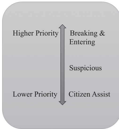
FIGURE 2 Information classification options

Figure 2 depicts information classification options, and associated priority levels, that would be potentially relevant to this call.