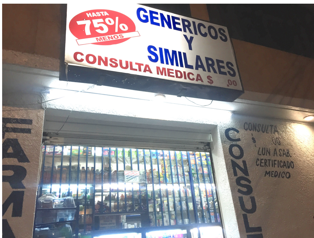
A knock-off simis pharmacy located in Colonia Periférico, near Alma's house. The red circle advertising "up to 75% less" mimics the branding of the original Farmacias Similares . The text to the right of the door advertises consultations with a certified doctor.