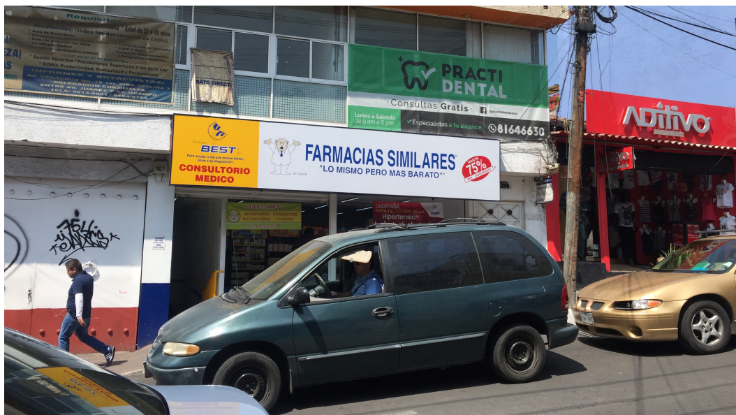
A generics pharmacy of the popular chain, Farmacias Similares. To the left of the store's name is Dr. Simis, the brand's mascot.

often difficult to distinguish between Farmacias Similares and the many simis emulating the original—save for the presence or absence of the cartoonish mascot of the smiling, open-armed doctor that greets customers on all the signage and advertisements of Similares proper.