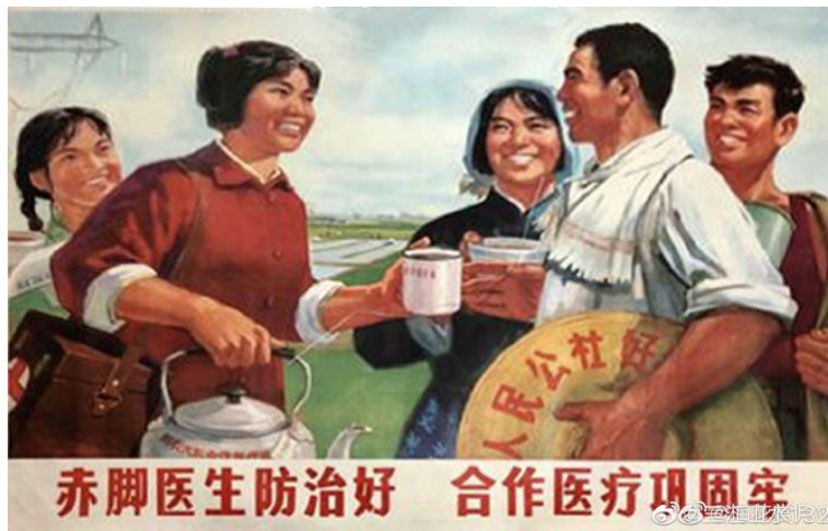
Figure 2-2 “Barefoot doctors do good prevention, cooperative medicine is strong and reliable,” artists and publisher unspecified, dimensions unspecified, private collection.