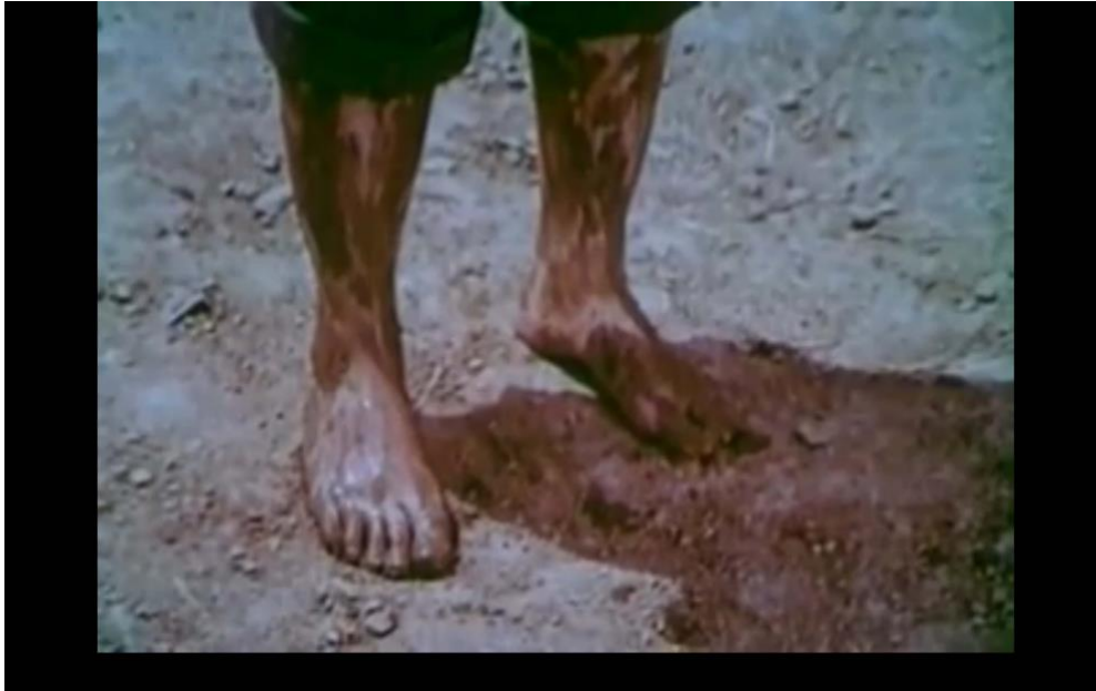
Figure 2-6 Close up of Haiying's feet during confrontation, still from "Yanming hu pan"