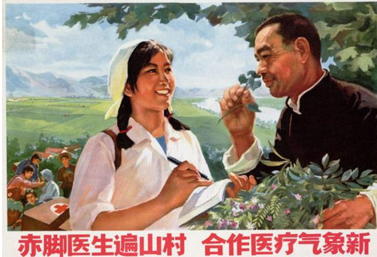
Figure 2-1 “Barefoot doctors are all over the mountain villages; cooperation creates a new atmosphere of medical treatment,” Wang Linkun collective work, Shanghai renmin chubanshe, 53 x 77 c.m., Stefan Landsberger collection of the International Institute of Social History, Amsterdam.