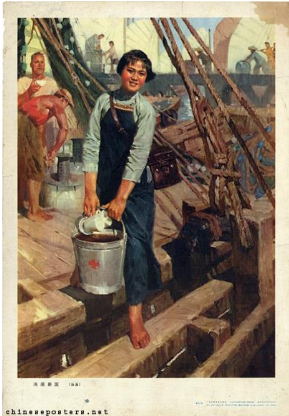
Figure 2-3 "A New Doctor in the Fishing Harbor," Chen Yanning, Renmin meishu chubanshe , 38 x 26 cm., Stefan Landsberger collection at the International Institute of Social History, Amsterdam.

But as a symbolic trope, bare feet cannot be understood exclusively as a signifier of gender. Rather, bare feet equally symbolized belonging within specific communities of laborers. Neither was the depiction of bare feet specific to women. Instead, bare feet should be understood as a symbol of both gender and class, and insisting on an erotic reading of their significance risks combining separate registers of cultural discourse into an imaginary construction of an essentialized and immutable 'traditional' Chinese culture. 50 For example, taking a closer look at Yugang xin yi , aside from the central figure, a male worker directly behind the doctor has rolled his pants up similarly to reveal bare feet. The local labor context of the docks serves as the essential context for bare feet,