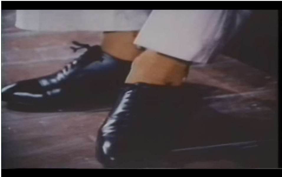
Figure 4-2 Close up of college student's clothing, still from "Juelie."

Through the peasant woman's eyes, Long witnesses her son's transformation from poor country boy to slick and arrogant college student. The transformation illustrates the destructive potential of education conceived as a generator of class distinction. Although the village boy achieves social mobility, moving from the lower-middle peasant class ( pinxia zhongnong ) into the educated, urban upper class, he removed from the generative social relations of his birth. By embracing a bourgeois identity, he no longer wishes to return to his home village, thus removing himself from his village's productive social relations. The knowledge he has attained has changed him as much as attending university has, revealing the problematic equation of knowledge with class standing. The village boy turned college student illustrates the perils of education for education's sake, a fundamentally destructive pursuit that prevents the production of a new socialist subjectivities, that of the educated peasant.