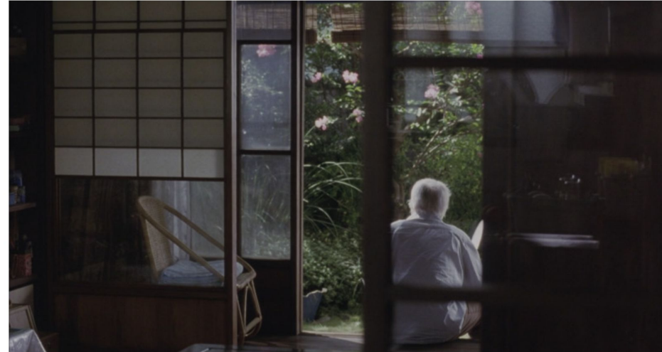
"Grumpy father sits alone in the backyard. His back view is seen through a wooden frame sliding glass door." Hirokazu Kore-eda. Still Walking . 2008.

Loss, memory, and trauma are recurring themes in Kore-eda's work. While it's tempting to associate them with the aesthetics and appreciation of imperfection in Japanese culture, Kore-eda insists he tries to tell the story of how the living people adapt and recover from sadness, emphasizing people's resilience in the midst of grief. During the shooting of two documentaries, Lessons from a Calf (1991) and However... in the time of Public Welfare Cuts (1991) , Kore-eda observed people's resilience and creativity when mourning the death. Through showing us a woman's mourning journey in profoundly poetic Maboroshi , Kore-eda shares his belief that death is a natural part of the living experience.