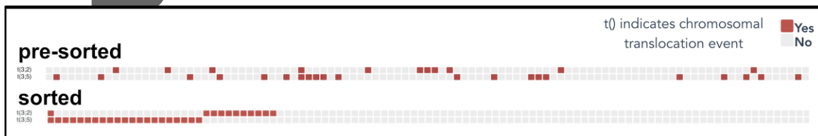
Figure 3 The t(3;2) and t(3;5) translocation events shown here are nearly mutually exclusive, which is not readily shown by the unsorted heatmap. Sorting the heatmap in descending order by t(3;2) followed by descending order by t(3;5) readily demonstrates this mutual exclusivity.

The value of the heatmap interactivity can be demonstrated in the following example. In the ccRCC study by Clark et al, the novel chromosome 3-2 rearrangement, consisting primarily of 3p loss and 2q gain, was observed to be nearly mutually exclusive to 3-5 translocation events. This mutual exclusivity is readily demonstrated by sorting the interactive heatmap by t(3;2) in descending order followed by t(3;5) in descending order, as shown in Figure 3 .