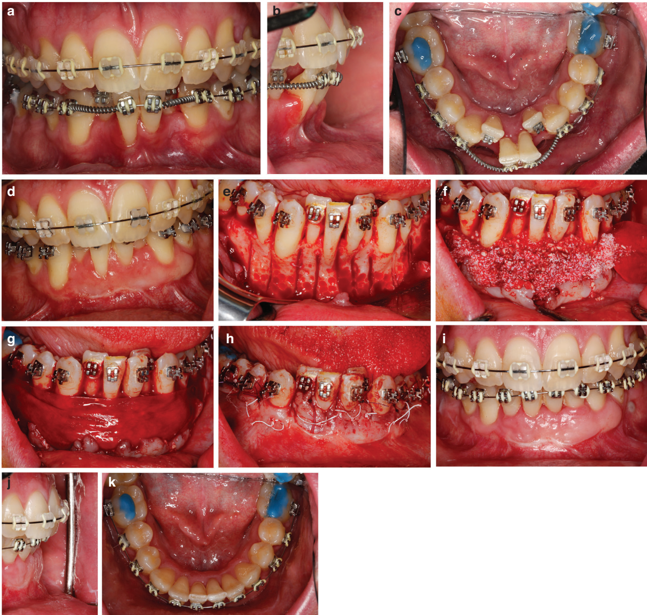
FIGURE 4 4a-c Class I malocclusion with severe crowding and dentoalveolar deficiencies. Initial exam Frontal, Lateral aspect demonstrating iatrogenic attachment loss secondary to tooth movement, occlusal view. Expansion is attempted but exceeding anatomic boundary conditions and risking tooth loss. 4d 12 weeks following cessation of orthodontic tooth movement and PhMT-soft tissue via autogenous free gingival graft (FGG) surgery to set up environment to support SFOT. 4e SFOT surgery 2 weeks post Botox of mentalis muscle to relieve strain and optimize flap closure. Corticotomies and dentoalveolar decortication performed. Note dehiscences remain and dentoalveolar deficiencies despite impression soft tissue outcome as a result of FGG surgery. 4f Particulate bone grafting to accommodate dental arch expansion and enhance orthodontic boundary conditions. 4g Stabilized collagen membrane for wound stabilization and graft containment. 4h Sutures and passive wound closure. 4i-4k 4 months post SFOT. Non extraction orthodontia nearly complete. Note significant phenotype modification through soft and hard tissue surgery. Expansion orthodontia is accommodated and tooth prognosis is now excellent.

and dentoalveolar deficiencies. PhMT-soft tissue was performed to convert and prepare the mucoingival environment 12 weeks prior to SFOT. Two weeks prior to SFOT surgery, botox was administered to the mentalis muscle to paralyze strain and optimize flap stabilization during initial wound healing. Orthodontic treatment by Jinjuan Hao, DDS, PhD (Chicago, IL).