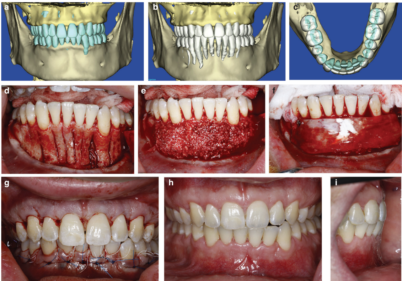
FIGURE 3 3a Case 1 Class II malocclusion with severe crowding and dentoalveolar deficiencies. Pre Op 3D CBCT regional anatomy presentation. 3b Orthodontic simulation of malocclusion correction by dental arch expansion. Note dentoalveolar deficiencies that do not allow conventional orthodontia to place teeth in such a position outside the orthodontic walls. 3c Orthodontic simulation of before and after arch forms planned to correct malocclusion. 3d Flap surgery with corticotomies and dentoalveolar decortication performed. 3e Particulate bone grafting to accommodate dental arch expansion and enhance orthodontic boundary conditions. 3f Stabilized collagen membrane placement for wound stabilization and graft containment. 3g Sutures. Esthetic crown enhancement performed in the maxillary arch. 3h and 3i 2 months post SFOT. Note intercincisal angle relationship produced through buccal root torque. Tooth movement is occurring through lingual orthodontia (Incognito™).

are taking anti-resorptive drug therapies predisposing to delayed healing or bisphosphonate related osteonecrosis of the jaw, when patient expectations are unreasonable (psychologic parameters not conducive to elective surgery), or if boundary conditions are adequate and sufficient for safe tooth movement to meet decompensation goals. Table 2 summarizes indications/rationale and contraindications for SFOT surgery.