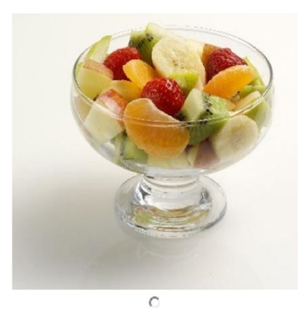
FIGURE 7 Stimuli used in Shen et al. (2016) [Colour figure can be viewed at wileyonlinelibrary.com]

synthesize much of this research helps to identify areas for future research that is founded in the existing research we have reviewed. As one of the most frequent consumer choices and one of the most common consumer experiences, taste and food consumption research plays an integral role in consumer psychology research.