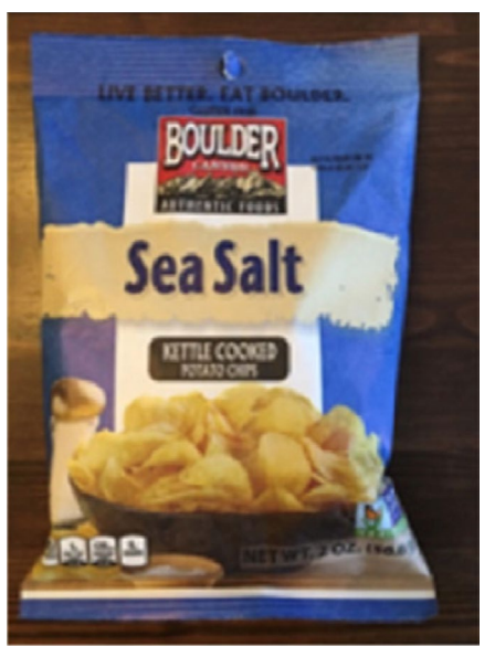
FIGURE 3 Experimental stimuli used in Ye et al. (2020) [Colour figure can be viewed at wileyonlinelibrary.com]