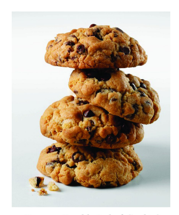
Fancy a Freshly Baked Cookie?

In a research context, Dubose et al. (1980) show that determining the flavor of a colored beverage is a very challenging task for consumers when color is obscured or manipulated. Participants in their studies were only able to identify the flavor of the beverages 20%