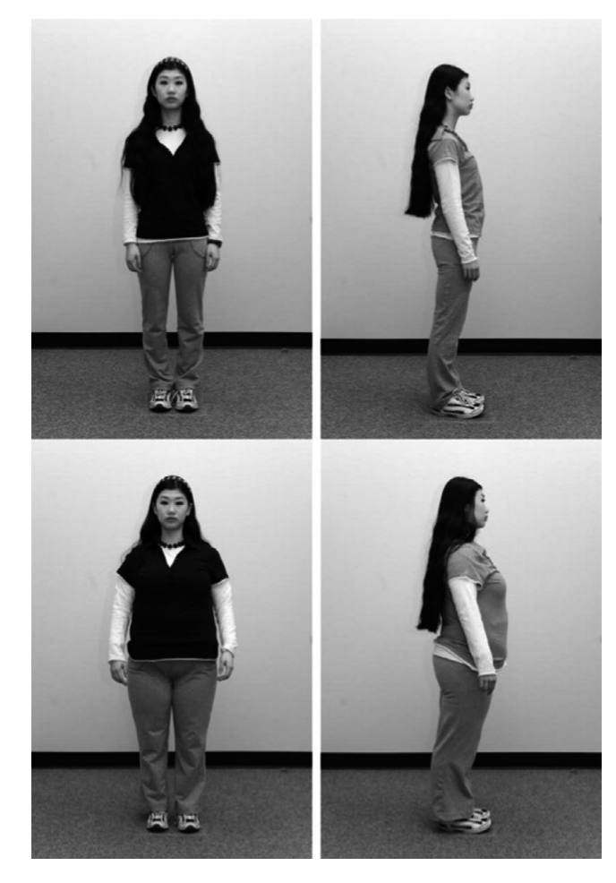
FIGURE 5 Image of experiment confederate from McFerran et al. (2010b; Figure 1)

A different way in which another person can matter in the food context is in terms of "who" served the food. Hagen et al. (2017) show that people choose a larger portion size of unhealthy food when someone else served them (versus when they serve themselves).