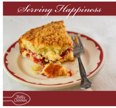
FIGURE 6 Advertising stimuli used in Elder and Krishna (2012) [Colour figure can be viewed at wileyonlinelibrary.com]