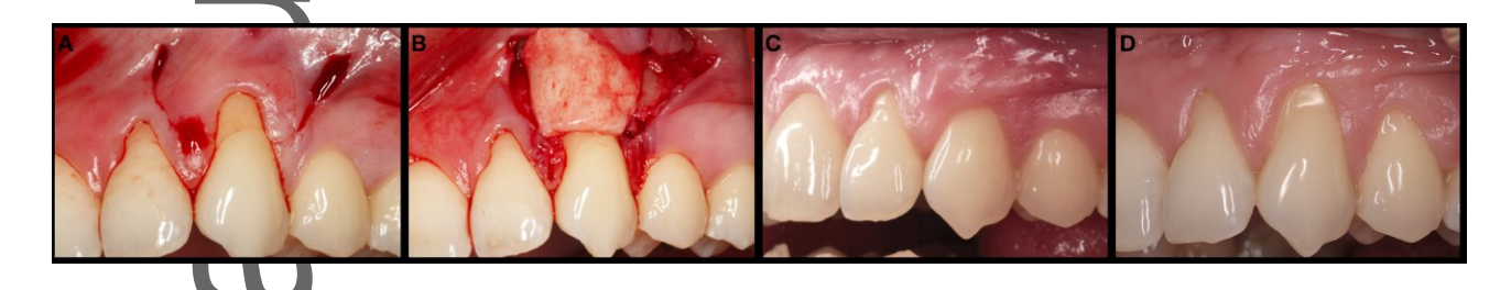
Figure 2. Root coverage outcomes of an isolated gingival recession treated with ADM. A) Baseline. B) Positioning of the ADM on the recipient bed. C) 1-year outcomes. D) 9-year outcomes. Note the relapse of the gingival margin in the ADM-treated sites and the apical shift of the gingival margin of the adjacent untreated teeth at the 9-year recall.