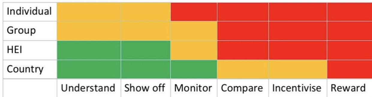
Figure 1. Risks associated with metric use in various settings