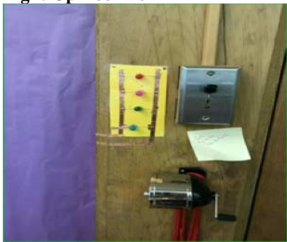
Light-Up Door Bell

“Our invention solves the problem we identified by making people happier when they see the emojis. Our invention will help our classroom by making people feel better. Our invention is sustainable because it will not break very easily.”