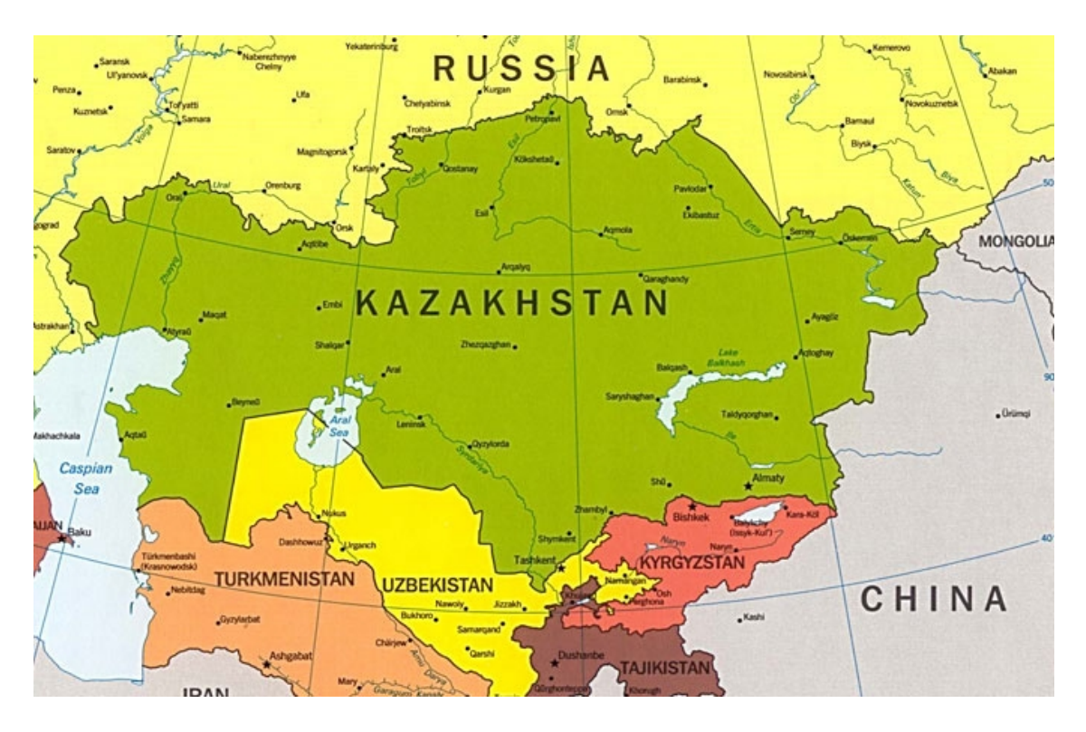
Figure 1.1: Map of Kazakhstan and bordering countries<sup>1</sup>

Another important facet of Kazakhstan's political actions is its geographic positioning. It maintains a unique position in the world, as it is strategically located between two major world powers, China and Russia. This is displayed in the map above. Nazarbayev's skilled leadership helped Kazakhstan open its borders and establish itself as a country with a potential beyond that expected of a post-soviet autocratic government. This thesis will answer the question of how Kazakhstan's foreign policy has grown under the leadership and outward focus of Nazarbayev and the Kazakh government. I argue that Kazakhstan, after independence, positioned itself in a place of power by using its ambitious foreign policy to bolster Kazakhstan's leadership in international organizations, advance domestic economic infrastructure, and internationalize its