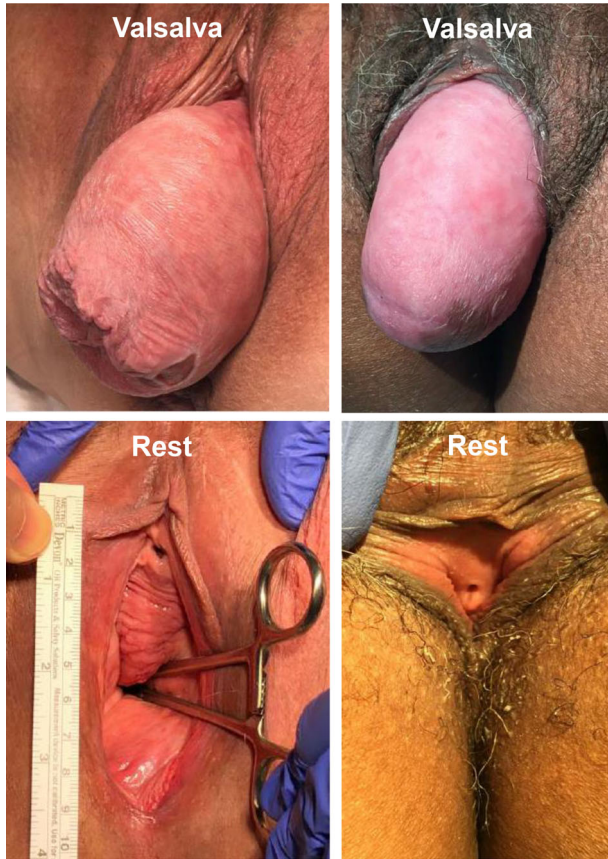
FIGURE 1 Differences in resting genital hiatus size in women with advanced pelvic organ prolapse. This figure shows that resting genital hiatus size can vary widely between women, despite a similar maximal prolapse size

Women with baseline impairment in resting GH closure may be at increased risk for prolapse recurrence, and furthermore, may benefit from a surgical procedure aimed at restoring the size of the GH. While GH rest is not routinely measured at all institutions, this measurement is routinely collected by providers at ours. Our primary aim was to determine if there is an association between preoperative GH rest and prolapse recurrence. Secondarily, we sought to identify other factors associated with prolapse recurrence.