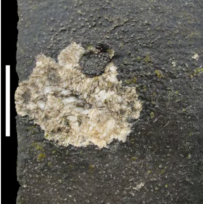
FIGURE 2 — Detail of the coping stone, a highly fossiliferous Mississippian limestone. The lobate mass of white calcite crystals, left of center, was presumably organic in origin, but is now unidentifiable. After slabbing, it was bored, but this hole is now infilled with cement. Syringopora sp. is prominent towards the top. Scale bar represents 50 mm.

was the coral colony growing attached to what is now a recrystallized mass of calcite; and, if so, what was the nature of the substrate at that time? The former question is the easier and answerable in the affirmative. Although rare, at least one other Syringopora — substrate association has been reported from Dutch building stone, the coral growing on a coiled mollusk (gastropod or cephalopod(?)) shell (Donovan, 2016; Van Ruiten and Donovan, 2018). An analogous association is determinable in the present specimen. Evidence includes some corallites of the colony occurring within a few millimeters of the calcite mass and the colony itself curving around the presumed substrate (Figs 2, 3). An intimate relationship during the life of the colony was thus highly likely, perhaps near-certain.