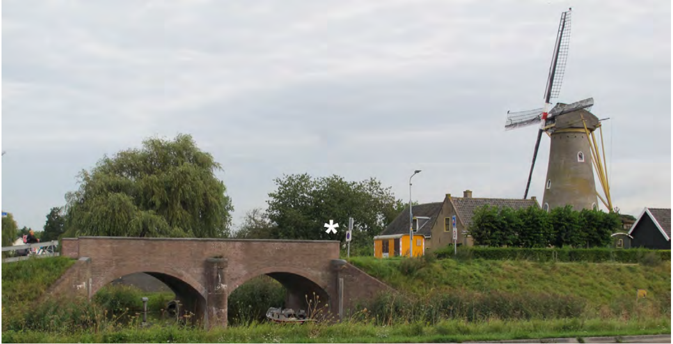
FIGURE 1 — A view of the locality, a canal bridge on Hoofdweg – Westzijde, Hoofddorp, the Netherlands. It is photographed from near the corner of Graan voor Visch and Hoofdweg – Oostzijde. The windmill – Korenmolen De Eersteling – is a notable local landmark. This site is about 1.3 km northwest of Hoofddorp railway station, on the Amsterdam Schiphol to Leiden line. The asterisk (*) marks the position of the fossiliferous coping stone of interest.

In consequence, it is significant to record a feature that I have seen many times without being able to interpret it adequately. Publishing details of this association may spark the interest in someone more knowledgeable in recrystallized fossils and/or sedimentary structures; I hope so. The feature was of particular interest in that it is exposed in a bridge cladding within a few hundred meters of my former home in Hoofddorp, the Netherlands. In a country with no natural outcrops of Mississippian limestones, this man-made edifice exposes an enigmatic association between a tabulate coral and a recrystallized structure of unknown organic(?) origin.