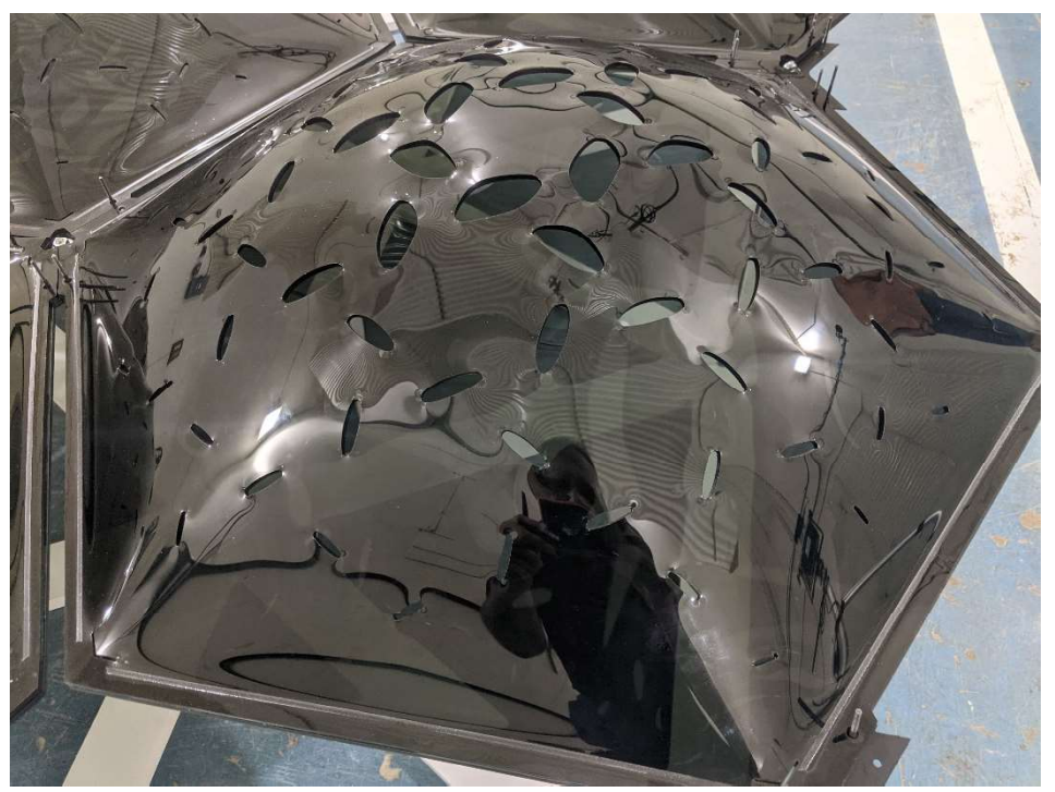
Figure 5 – Detail of curvature and perforations on some specimen glass panels