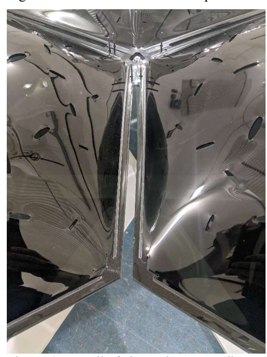
Figure 6 – Detail of air gap between adjacent pairs of glass plates