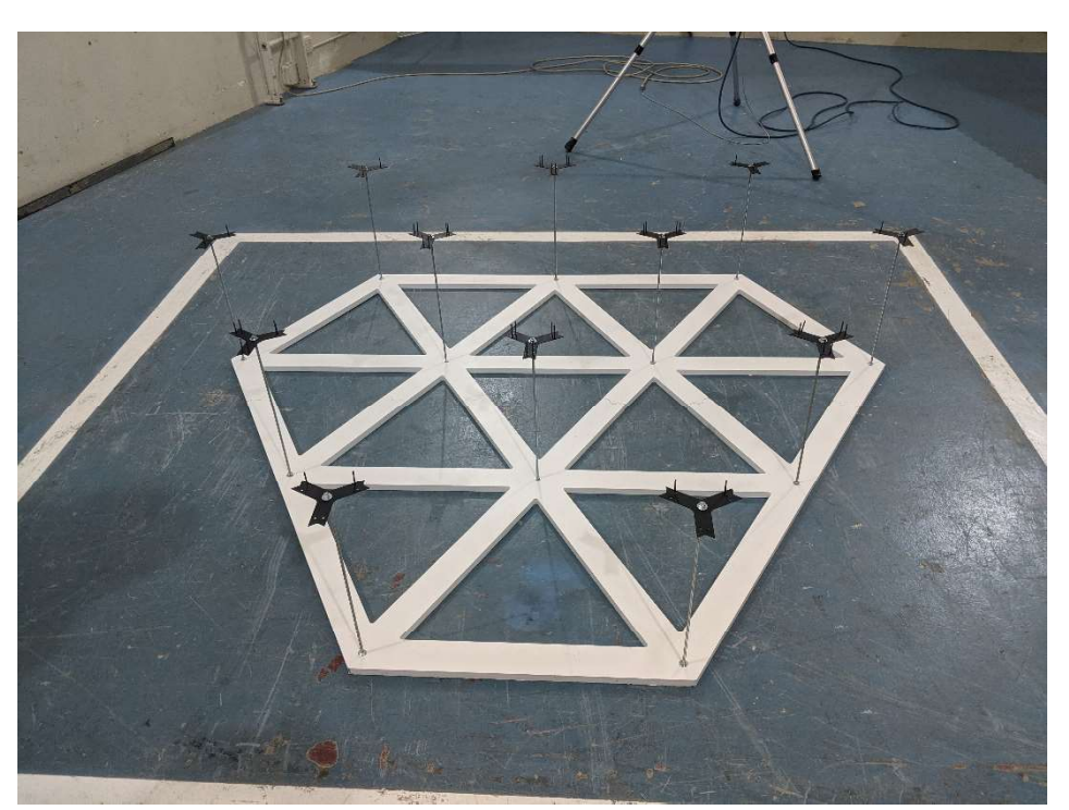
Figure 3 – Base frame and support rods in test chamber prior to installation of glass units