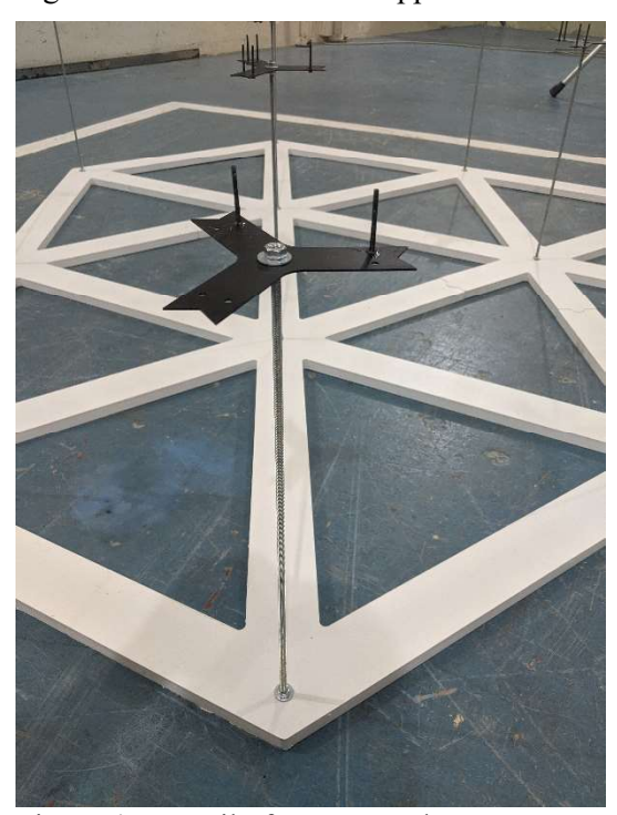
Figure 4 – Detail of support rod