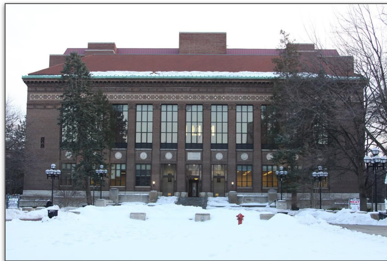
Photograph of the Hatcher Library with a bit of snow