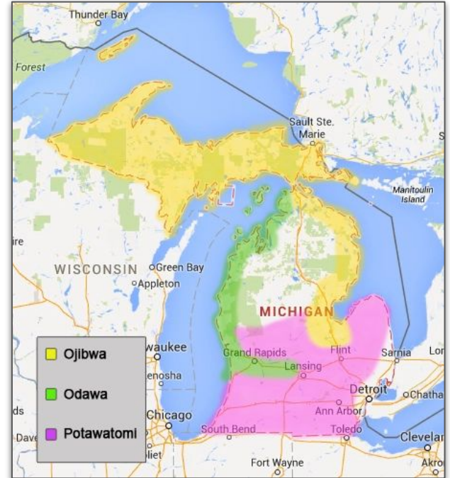
Map of Michigan showing locations of the Ojibwe, Odawa, and Potawatomi peoples.

Please also consider exploring the Land Reparations & Indigenous Solidarity Toolkit and making a donation to the Indian Land Tenure Foundation or another Indigenous-led nonprofit .