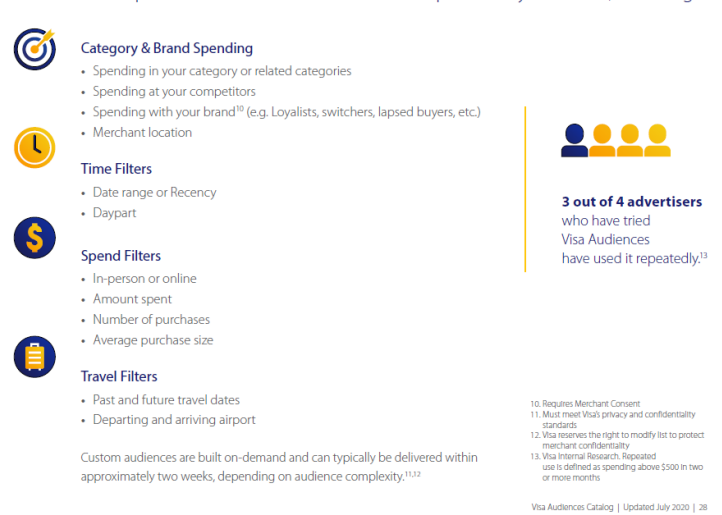
Figure 3 . Visa Ad Solutions advertisement published in the Visa Audiences Catalog in July, 2020.

Design your custom audience to your precise specifications. Reach out to your Visa Ad Solutions representative to discuss the best data points for your needs, including: