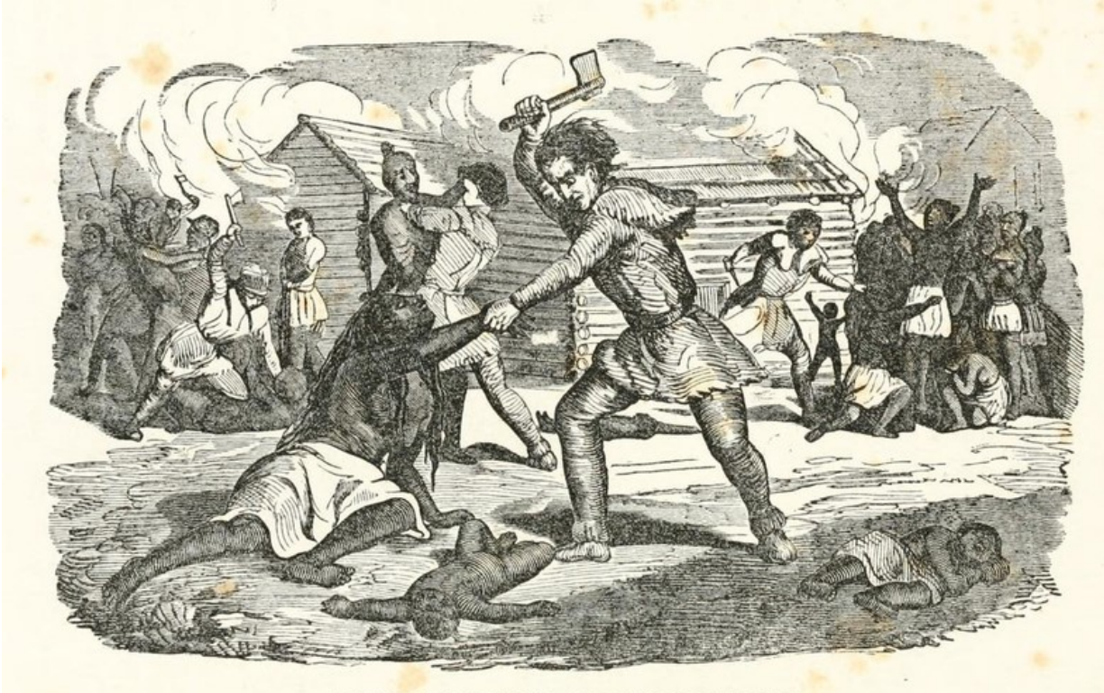
MASSACRE OF THE CHRISTIAN INDIANS.

One is the Gnaddenhutten Massacre. In the early 1780s, on the frontier, what historians call the First-West, there were frequent raids upon American settlers. Often raiding parties would move hundreds of miles from their homes, stopping at friendly Indian villages for supplies or to trade. One such village was the Christian Indian community at Gnadenhutten in central Ohio (30 miles south of Canton). These Pennsylvania Indians had embraced Christianity in the early decades of the century, won over by the pacifist Moravian Brethren. They had lived in the Moravian settlement of Conestoga near Lancaster but had been forced to evacuate in 1763 after an attack that left six Moravian Indians dead. By 1772 they had settled in Ohio on the Tuscarawas River, a branch of the Muskingum. It was a quiet, isolated place, in a beautiful setting. Their advocate,