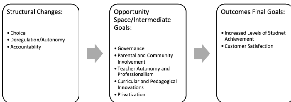
Illustration of the Charter School Concept (adapted from Miron & Nelson, 2002)

This illustrative model demonstrates how the key factors in structural change will lead to the different opportunity space which will play a role on final expected outcomes. Figure 2 highlights three primary areas in which structural change has been made – Choice,