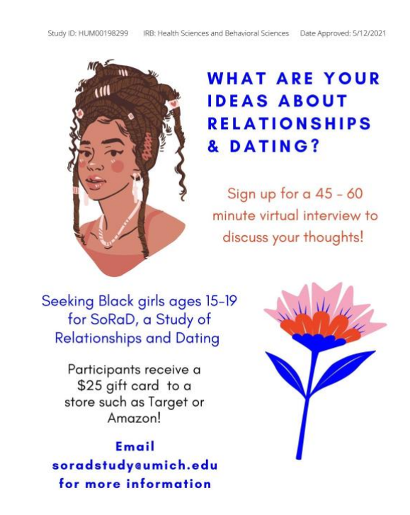
Figure F1. Recruitment Flyer 1.