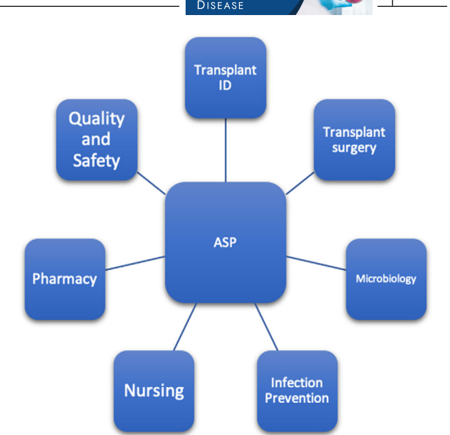
FIGURE 2 A multidisciplinary approach to antimicrobial stewardship (ASP) in solid organ transplant patients

Recommended ASP interventions in SOT mirror general ASP interventions to some extent, with some important considerations. The implementation of PAF has been shown to be effective and safe for SOT recipients. <sup>16</sup> This strategy is viewed more favorably among transplant physicians compared to formulary restriction and has also been found to be more impactful than restriction in decreasing antibiotic use. <sup>15,68</sup> The implementation of transplant-specific antibiograms can assist in defining and tracking SOT-specific resistance patterns and in choosing empiric antimicrobials tailored to this population. <sup>18-20</sup>