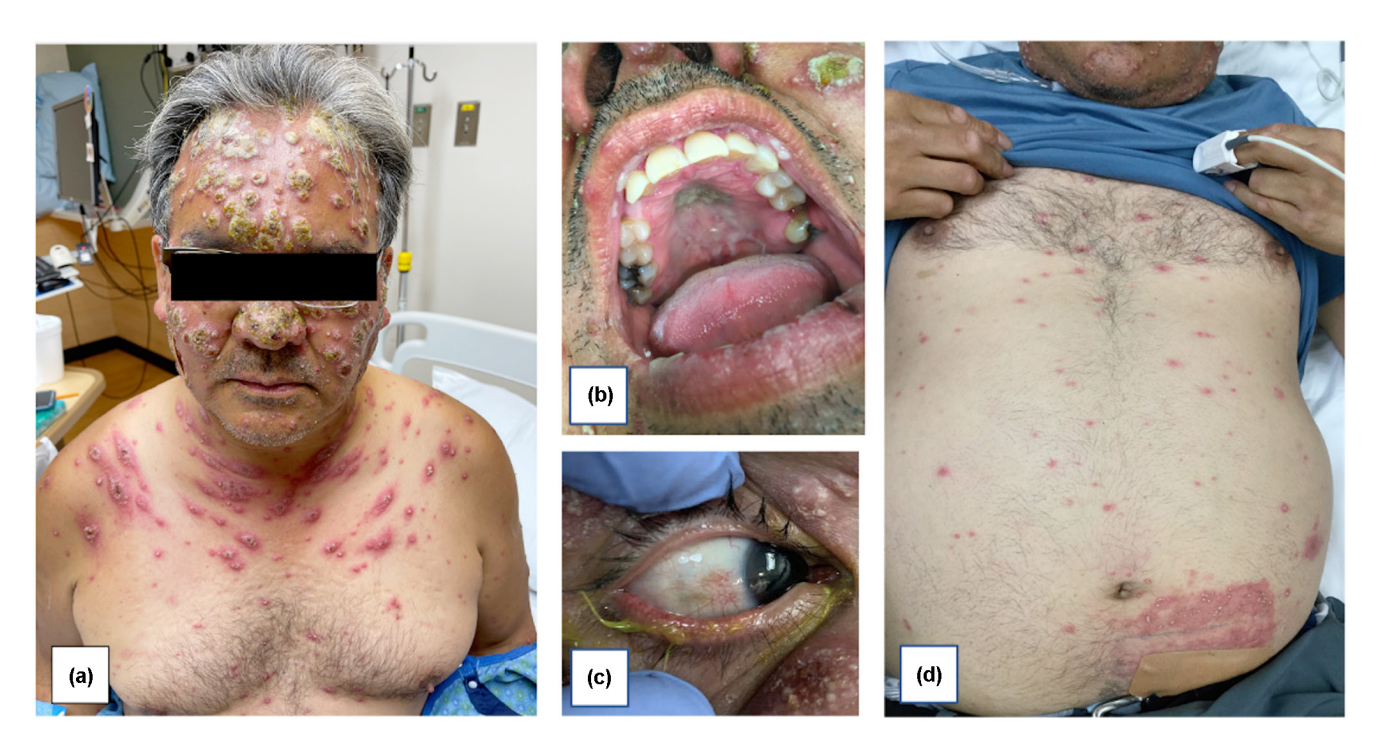
FIGURE 1 Clinical presentation of a 53-year-old male with trimethoprim-sulfamethoxazole-induced pustular Sweet syndrome. (a) Clusters of pus-filled, edematous papules and nodules with central crusting, imparting a targetoid appearance, especially on the face. (b) Coalescing pustules on the palate. (c) Yellow conjunctival drainage. (d) A square-shaped erythematous plaque studded with pustules on the abdomen, consistent with pathergy from an adhesive bandage.

Drug-induced Sweet syndrome (DISS) is an uncommon subtype of SS, comprising <5% of cases. Granulocyte colony-stimulating factor (G-CSF) is the most common culprit, but other drugs have been implicated, including TMP-SMX. It may be challenging to distinguish DISS from other SS subtypes, as patients often have prior or concurrent infections or neoplastic disorders.