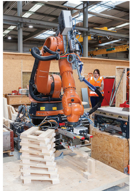
3 Fabrication setups: a) work cell I; b) work cell II