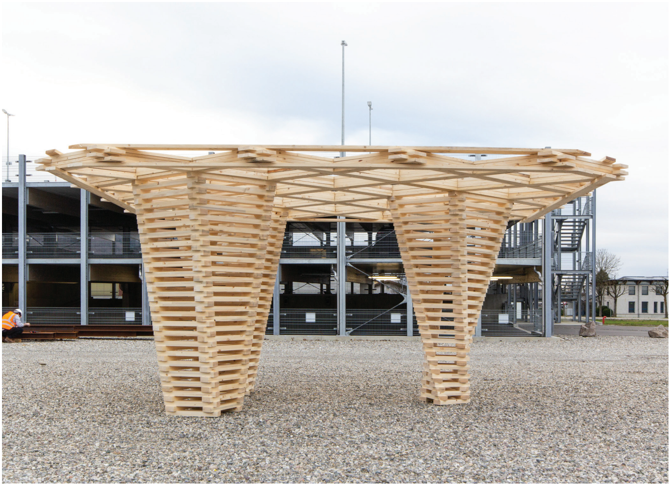
2 The case study structure

station that included nine slots for picking timber elements. The second work cell consists of a six-axis robotic arm 1 with a payload of 240kg and a reach of 2.9m, mounted on an external linear axis with a length of 4.5m (Figure 3b). The working envelope of this setup is 10.3m in length, 5.8m in width, and 2.9m in height. Besides the robotic arm, this setup includes a picking station, a table saw, and an assembly platform. The robotic arm is equipped with a custom-built pneumatic gripper that includes an automatic screwdriver for joining timber elements.