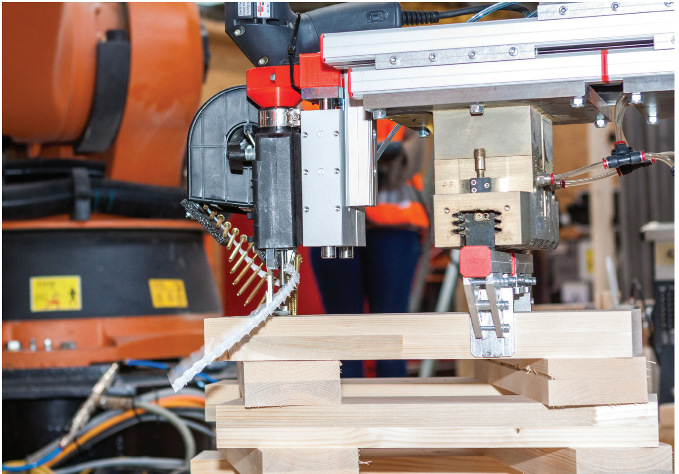
5 Robotic placing of a timber slat and automatic insertion of screws

changes its end-effector to a circular saw attached to a spindle, and trims their corners in-place (Figure 4).