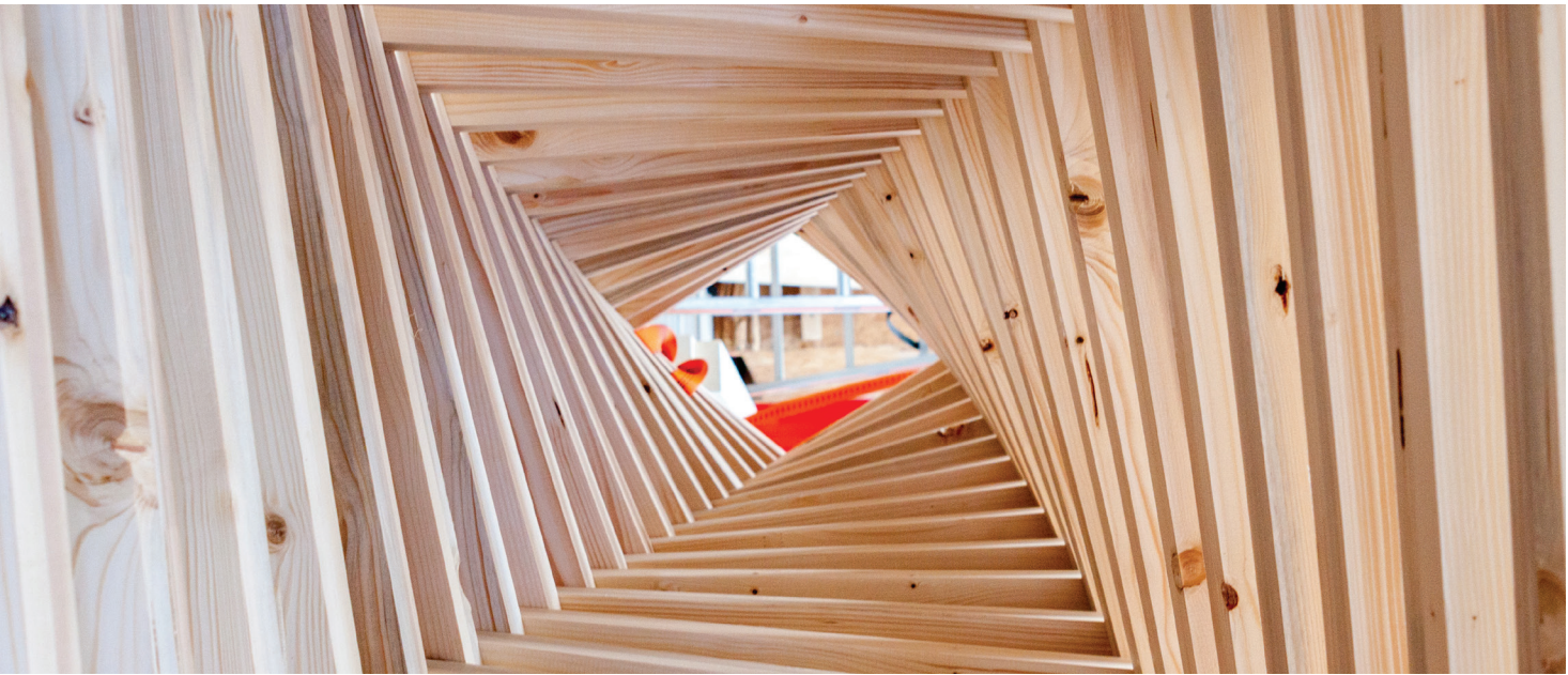
1 A bespoke timber sub-assembly