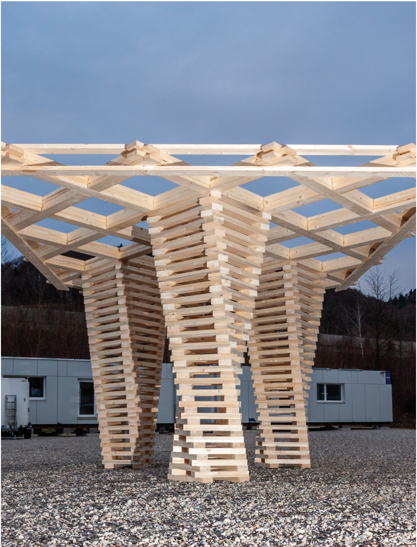
8 The fully-assembled timber structure