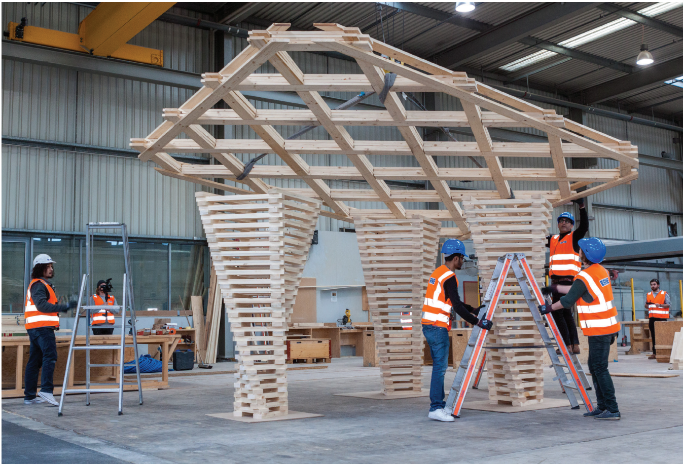
6 Connecting the pre-assembled roof and vertical supports