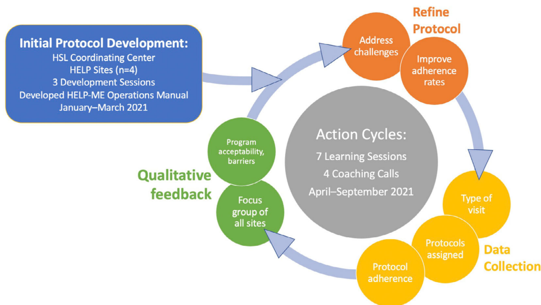
FIGURE 1 Overview of Modified and Extended Hospital Elder Life Program (HELP-ME) Process. The Initial Protocol Development Group was created with four AGS CoCare ® : Hospital Elder Life Program (HELP) sites and the coordinating center (blue rectangle). The action cycles (gray circle) were centered around 11 webinars, which included seven learning sessions and four coaching calls. Sites were assigned to modify 1–2 HELP protocols during the first action cycle and further refine the protocols in subsequent cycles based on data collected and feedback received from patients and families.

and adaptation at the individual site according to the needs of the patient. Each of the 11 protocols could be assigned to a patient 1, 2, or 3+ times per day, or not at all, depending on the clinical situation. For example, the orientation protocol would be assigned three times per day for patients with cognitive impairment, whereas patients ordered to be on bed rest would not be assigned the walking protocol. If a protocol was assigned but not completed, all reasons were selected from a checklist and annotated with free text details. All sites were encouraged to provide as much detail as possible. Adherence was achieved if the patient completed all parts of the assigned protocol for the total number of times it was to be given that day. Non-adherence occurred if the protocol was partially completed or not completed at all. Partial completion occurred if the patient received some but not all parts of the protocol on at least one occasion, or if they did not receive the protocol for the required number of times that day. If the assigned protocol was not executed that day at any time, the protocol was marked as not completed. An adherence rate was then calculated for each protocol by patient-day by taking the total number of complete adherence occurrences divided by the total number of days during which the protocol was assigned to be administered.