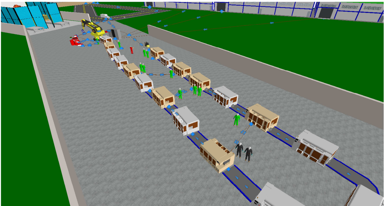
Figure 2. Model Animation Showing the Revised “U”-Shape of the Assembly Line