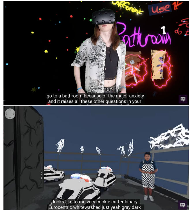
Figure 2: Images from the Creative Futures project's film [49] showing trans young people's VR creations.

At the same time as the project enabled Paré and Windsor to tell diverse trans stories using an innovative medium, it was also a way to teach VR skills to young people.