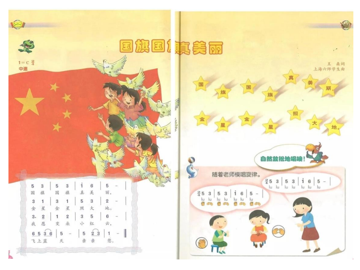
Figure 2 "Beautiful National Flag" (a singing piece in the third unit of the first-grade textbook)

"Washcloth" and "Let's Work Together." The fifth unit of the fourth grade, titled "Scenic Beauty," praises the beauty of nature and teaches students about environmental protection.