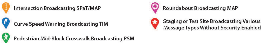
Figure 2: The AACVTE Deployment Area

The AACVTE deployment was not as straightforward as initially anticipated, however.