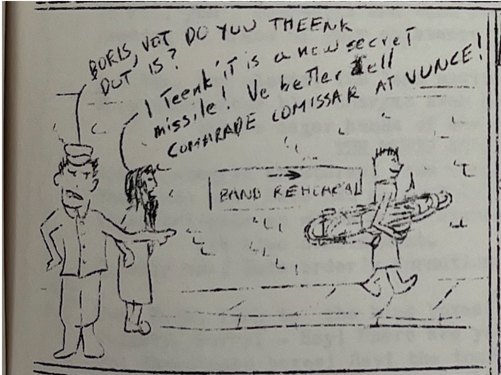
Figure 4: Cartoon 3 from The Leaky Bugle , Box 2, Symphony Band 1961 Tour collection, Bentley Historical Library, University of Michigan.

Another cartoon, also just a singular panel, pokes fun at Americans' poor Russian language skills, but ultimately portrays America as the dominant global power. In the foreground, a Soviet man in an ushanka (traditional Russian hat) greets an American man holding a suitcase. The American butchers an attempt at saying hello in Russian, instead mispronouncing the word for goodbye, "er, ah, 'POST VIDANYAH!'" The Soviet man replies, "Like, yeah man, and how are things swingin' over in Capitalistville?" 35 The use of language is particularly interesting in this cartoon. The Soviet man speaks fluent, unaccented, colloquial English, whereas the American struggles over basic Russian. On the surface this appears to make fun of the Americans for their monolingualism, but on a deeper level it speaks to global power