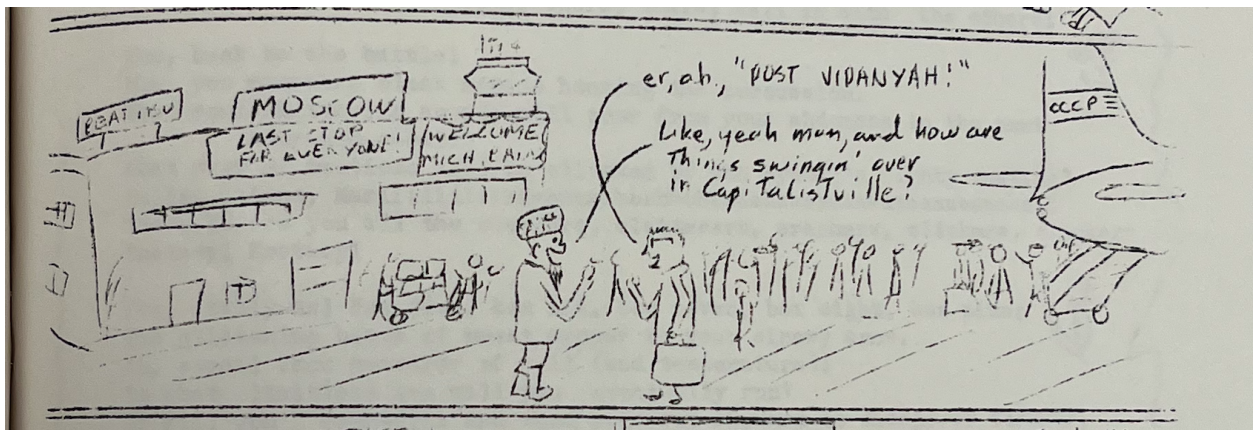
Figure 5: Cartoon 2 from The Leaky Bugle , Box 2, Symphony Band 1961 Tour collection, Bentley Historical Library, University of Michigan.

dynamics. The Soviet man's fluent English skills perhaps indicate that English is the more globally dominant and culturally influential language—the Soviets are essentially forced to learn it to participate in global exchange (even when that exchange is happening on their home soil), whereas the Americans can get by without learning Russian. This portrays America (“Capitalistville”) as the more dominant global power than the Soviet Union during a time when both empires were fighting for that position. It is also significant that this cartoon depicts Soviets as having flawless English skills whereas the first cartoon portrayed the Soviets as having thickly accented English. Americans alternate fluidly between these two portrayals of Soviets, but both ultimately work to the benefit of the Americans. The thickly accented English feeds into stereotypes of Soviets as uncultured, and the flawless English points to the global dominance of English. Both of these scenarios rely upon ideologies of Americans as the global cultural standard.