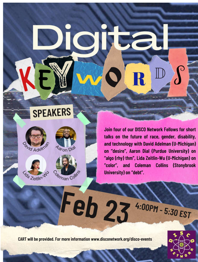
ID: Dark blue blurred circuit background. 'Digital' written in large white text at the top of the poster, and underneath, 'keywords' is spelled out