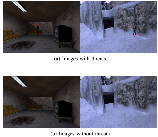
Fig. 2: Examples of a threat

Detection task. In addition to the tracking task, participants were responsible for detecting threats. Each trial involved participants receiving a new set of four static images from the drones for threat detection. The images were presented as shown in Figure 1(b). The threat being detected was represented by a person, as illustrated in Figure 2(a), and only one threat appeared among the four images. There were no distractors included in the images so that the participants did not have to determine whether the person depicted was a friend or foe. The distribution of threats across the four images followed a uniform distribution, ensuring randomness.